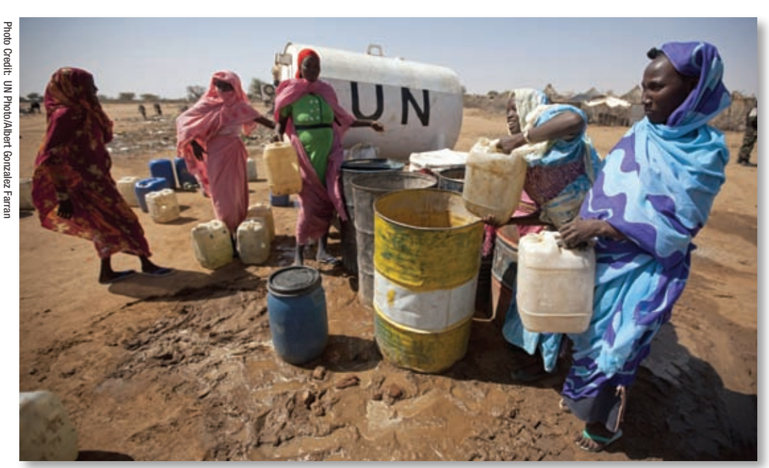
WORKING TOGETHER: Women collect water from a tank installed by the African Union-United Nations Hybrid Operation in Darfur (UNAMID) near UNAMID's team site in Khor Abeche, South Darfur.

Constituting a majority of the world's poor and at the same time bearing responsibility for half the world's food production and most family health and nutrition needs, women and girls regularly bear the burden of procuring water for multiple household and agricultural uses. When water is not readily accessible, they become a highly vulnerable group. Where access to water is limited, the walk to water is too often accompanied by the threat of attack and violence.