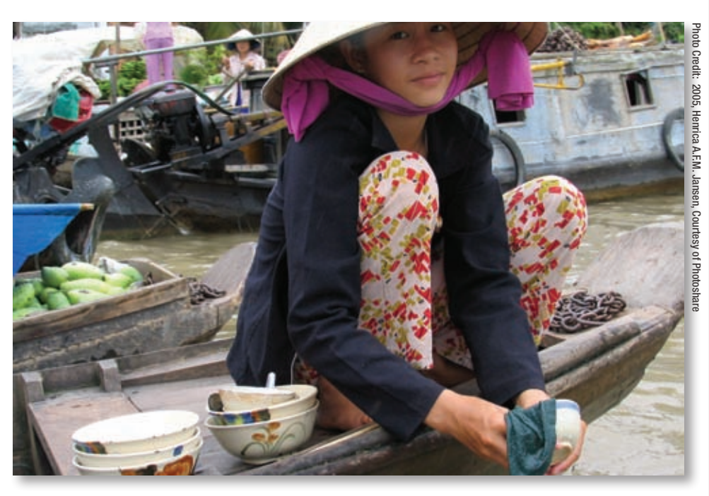
DESPERATE MEASURES: A woman on a floating market boat must wash her dishes in the polluted river in the Mekong Delta region of Vietnam.

But there is hope. Women are incredibly resourceful, resilient, and innovative, and when they are involved in developing solutions, they make decisions that enhance the lives and livelihoods of their families and communities. At ACCION International, I witnessed firsthand the remarkable changes that occur when women living in poverty are provided opportunities. A small microloan can make the difference between hunger and prosperity.