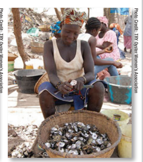
FRUITS OF LABOR: A local woman sits near her basket of recently harvested oysters in hopes of selling her wares.

moving forward ever since to achieve a common goal: to become self-sufficient through improved cultivation techniques and marketing of the oysters they collect in the Tanbi wetlands near the capital of Banjul. In 2009, USAID lent its support to the program, providing much needed funding and management to help the women move that much closer to realizing their goal.