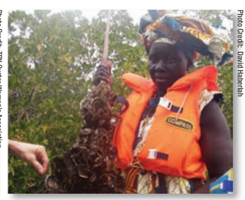
CATCH OF THE DAY: A Local woman shows how she collects and grows oysters on the roots of mangroves.

Those benefits include better equipment for oyster harvesters and an increased capacity to manage a profitable fishery. With expanded access to credit, the women have been able to purchase canoes, gloves, and life jackets, allowing them to safely harvest oysters. They also bought processing and storage equipment to diversify oyster products and transport them to regional markets.