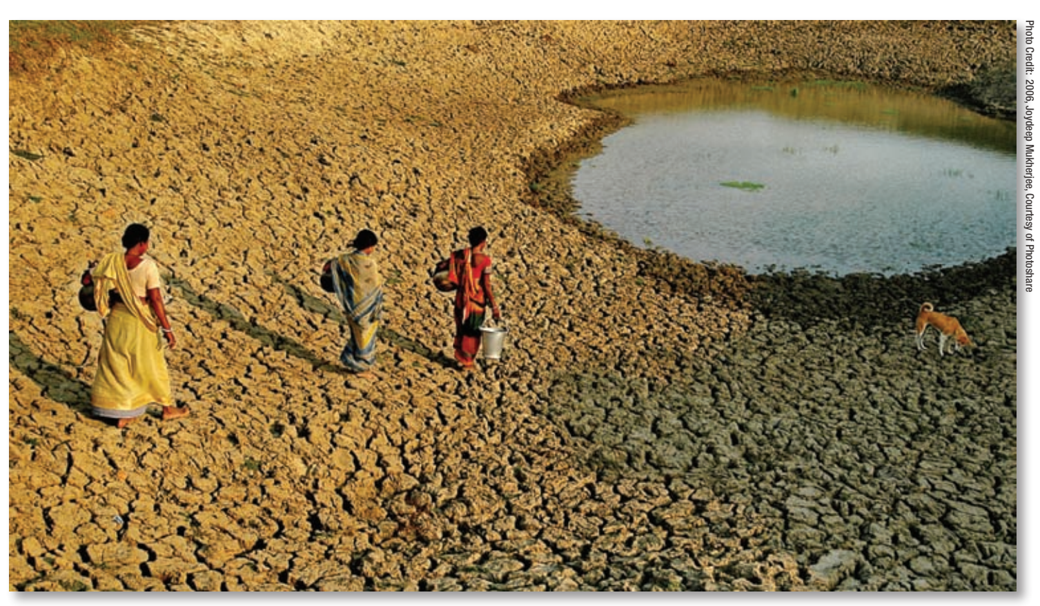
AT LONG LAST: Three women finally reach their water source, a low water level lake in India.

Picture for a moment the life of Meliyio Tompoi, a 35-yearold mother of six children, who lives in the Narok district in southwest Kenya. Most of the area's water points are dry, and she must walk 25 kilometers to collect water. This takes six hours each day. Although her household requires about 40 liters of water a day, Meliyio can only carry 15 to 20 liters on her own. So sometimes her family can only eat once a day due to the lack of water.