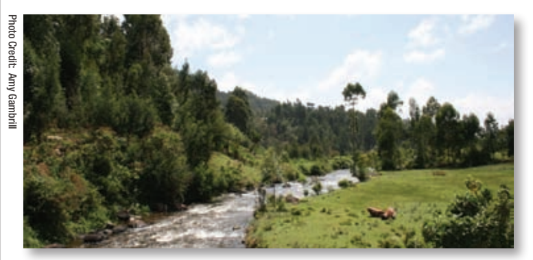
WATERSHED RESTORED: The Chania River flows at higher levels because Green Belt women's groups began reforesting the watershed.