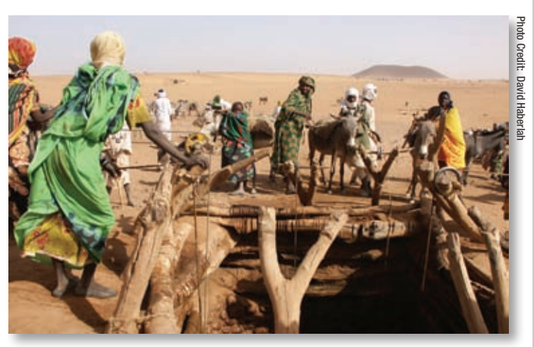
IT TAKES A VILLAGE: Women work together to build a viable water source in South

This preliminary inquiry is aimed at spurring applied policy research to deepen understanding of the connections between water access, gender-based vulnerability, and conflict, and to devise methods for addressing underlying causes. Some initial steps stand out. Staff working at the project-level can better understand the issues by asking how violence around water