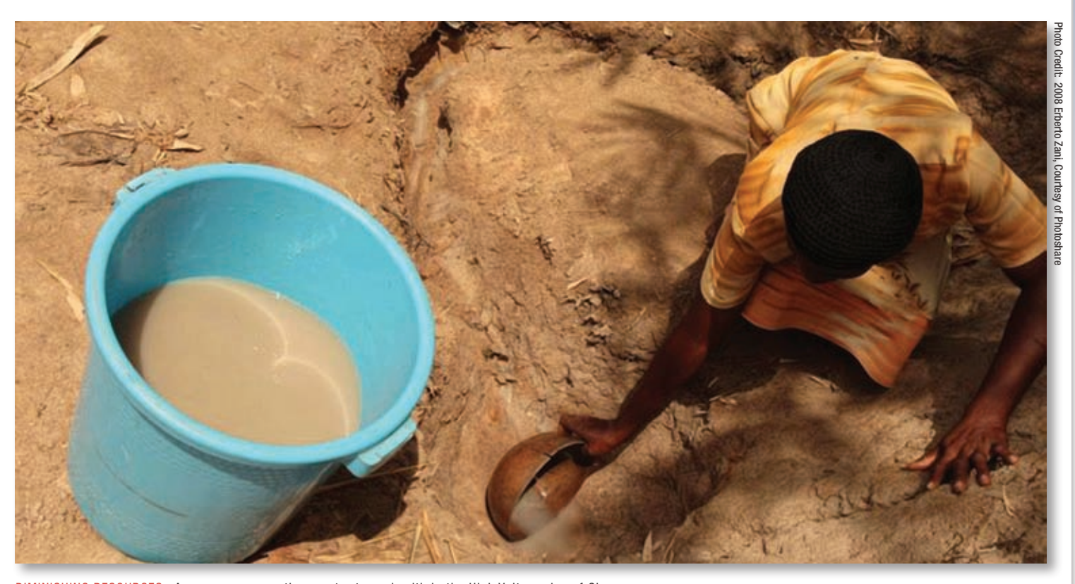
DIMINISHING RESOURCES: A young woman gathers water to cook with in the High Volta region of Ghana.

begin planting trees, which provide multiple resources to their communities: water, wood, and fruit, as well as cover and shade.