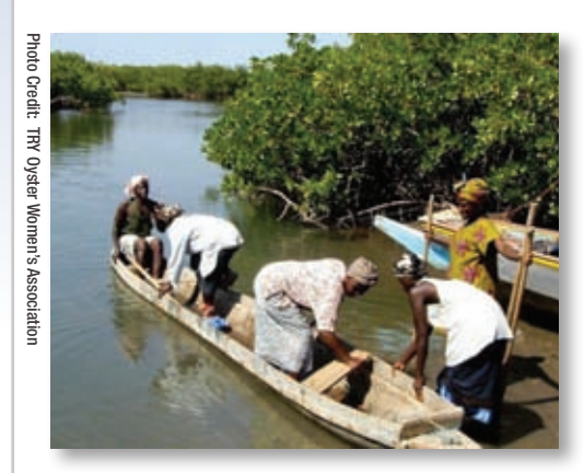
RIVER LIFE: Association members prepare for a day of oyster harvesting.