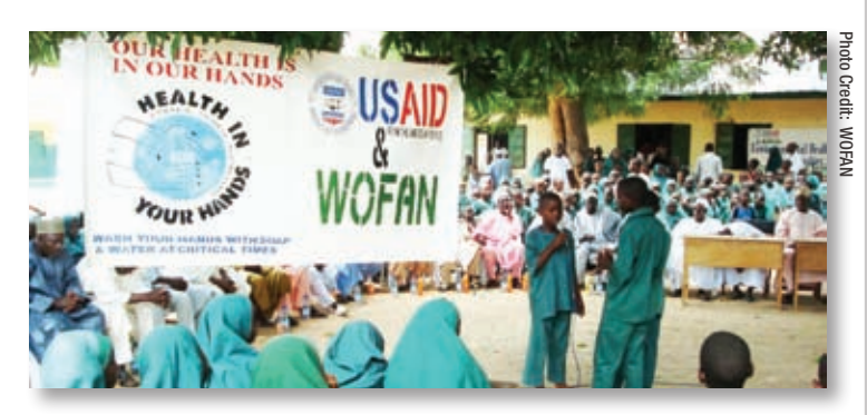
Representatives of USAID and WOFAN distribute hygiene and sanitation materials to schools in Liman Katagum of Bauchi state

WOFAN has established an 18-month partnership with USAID to improve access to clean water in 48 communities located in the states of Bauchi, Kano, and Sokoto. To date, the partnership has helped to build and operate hand pump boreholes, rain catchment systems, ventilated pit toilets, and hand washing stations. They have trained 340 people – many of them women - to maintain and repair the hand pumps. WOFAN also added