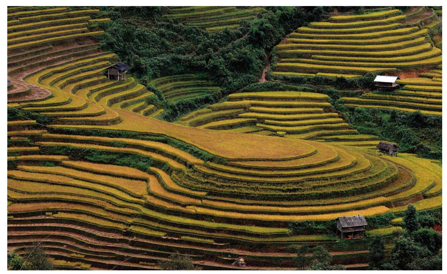
This picture taken on October 2, 2013 shows terrace rice fields in Mu Cang Chai district, in the northern mountainous province of Yen Bai.

Taken together, expanding the results we seek and deepening the way we consider risks will better ensure that we are investing and engaging with sustainability clearly in mind. Going forward, USAID will rely more on the approach of providing incentives in support of sustainability than on specifying targets for partnering with particular types of local actors or utilizing particular types of assistance.<sup>10</sup> A more holistic set of incentives, as laid out here, will help ensure that all of our potential investments are assessed in the same way for the results they generate, the risks they face and the rewards they offer. This even-handed examination of results, risks and rewards will empower staff to make the best choices about where to work and what partners to work with to support sustained development.