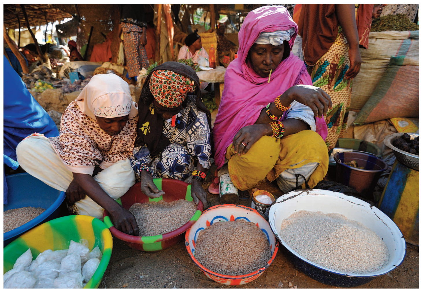
Women sell rice on January 30, 2013 at a market in the northern city of Gao.

1. Recognize that there is always a system. There are systems operating in every development context. No situation is a blank slate. As a result, thinking in systems terms and applying systems tools will provide valuable insights into the operating environment, including perspectives on why things are the way they are and what needs to change; the identity of key actors, key relationships and the