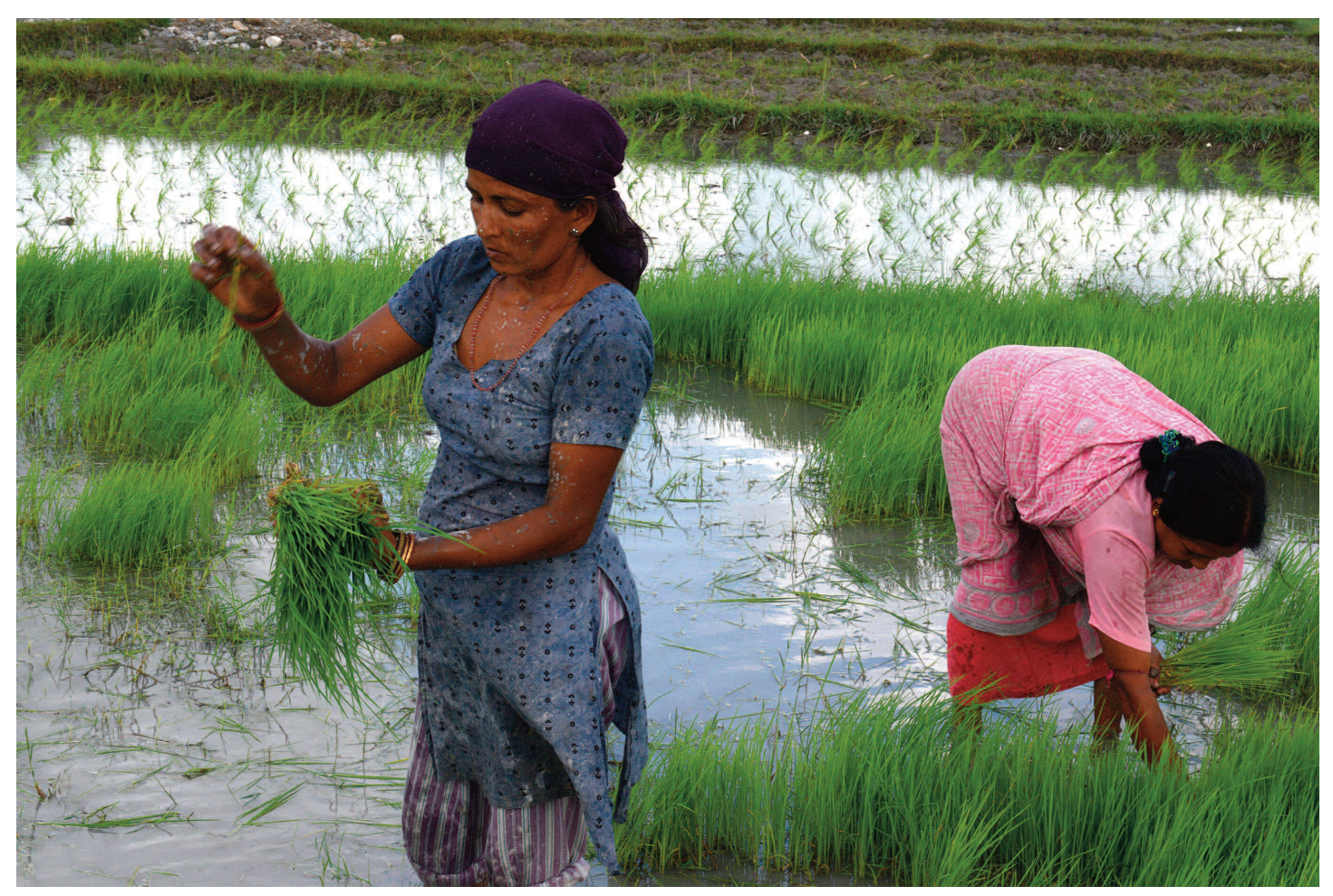
Indian farmers plant paddy saplings in a field at Milanmore village, on the outskirts of Siliguri.

Taking these initial steps, and indeed progressing toward the broader vision, will certainly require leadership, insight, creativity, resourcefulness and courage from many, both inside USAID and in the wider development community. But even more, such change will require persistence. Realizing these changes will take years and will be challenging to sustain in the face of demand for immediate results and the attraction of the triedand-true. Yet we must remain steadfast. Supporting sustained development is what defines us and is what the world expects.