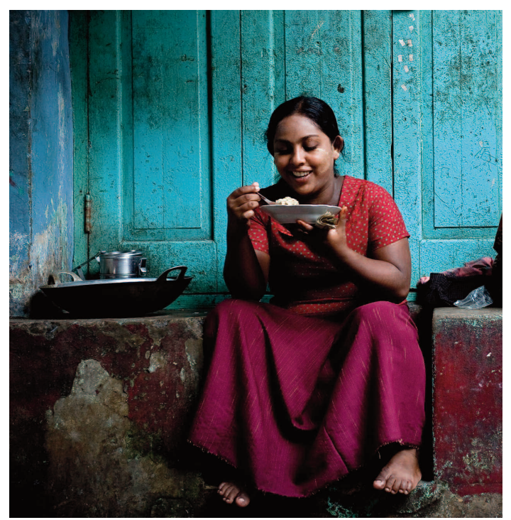
A woman eats rice on a street in Rangoon.