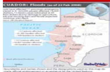
Ecuador: Floods (as of 22 Feb 2008) - Location Map