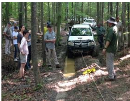
Participants learn to address critical safety and security issues during USAID/OFDA's SHOP course.

In addition to supporting training for staff across the international humanitarian community, USAID/OFDA designed a Security in Humanitarian Operations (SHOP) course designed to increase security awareness and emergency readiness among USAID/OFDA staff. USAID/OFDA piloted the course in July 2015 and in FY 2016 continued to support the development of the SHOP course as a key component of core staff training.