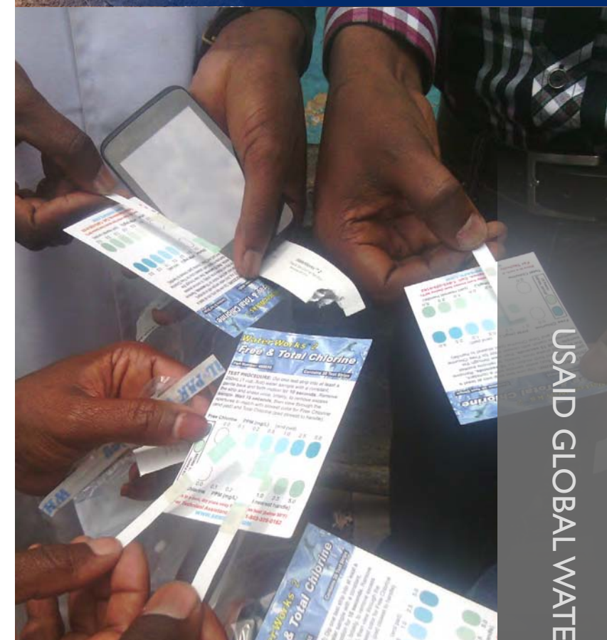
USER-FRIENDLY: mWater supplies cheap and reliable methods to perform basic testing.