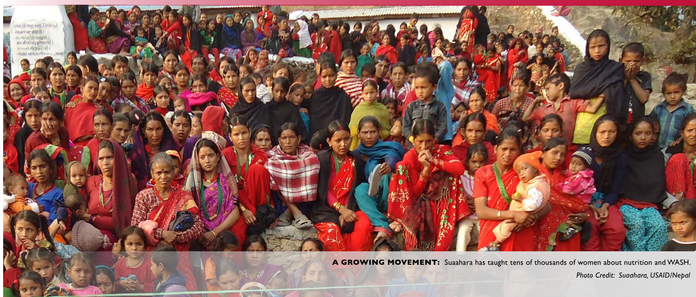
A GROWING MOVEMENT: Suaahara has taught tens of thousands of women about nutrition and WASH.