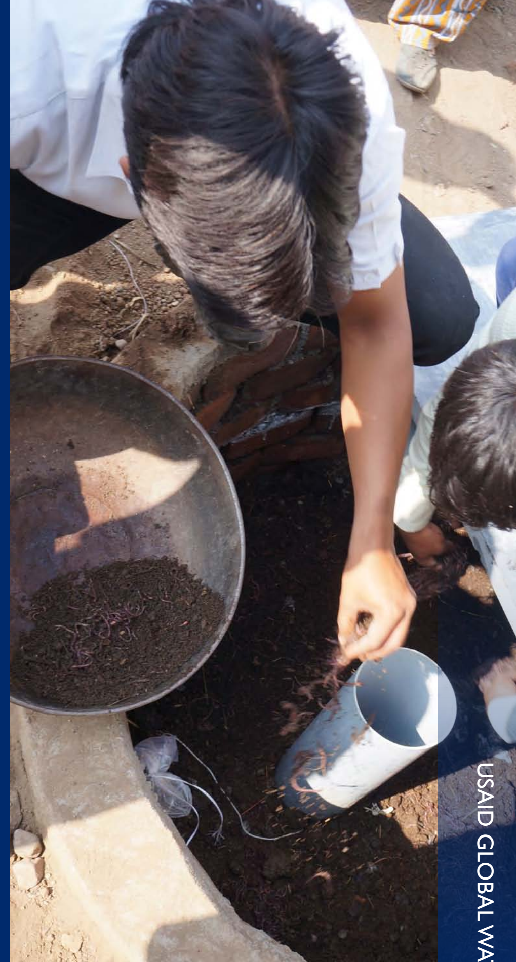
SUSTAINABLE SANITATION: The Tiger Toilets are new latrines which contain worms that eat excrement, reducing the system's waste by more than 80 percent.

In the past three years, the WASH for Life partnership has invested in 13 innovations in 10 countries.