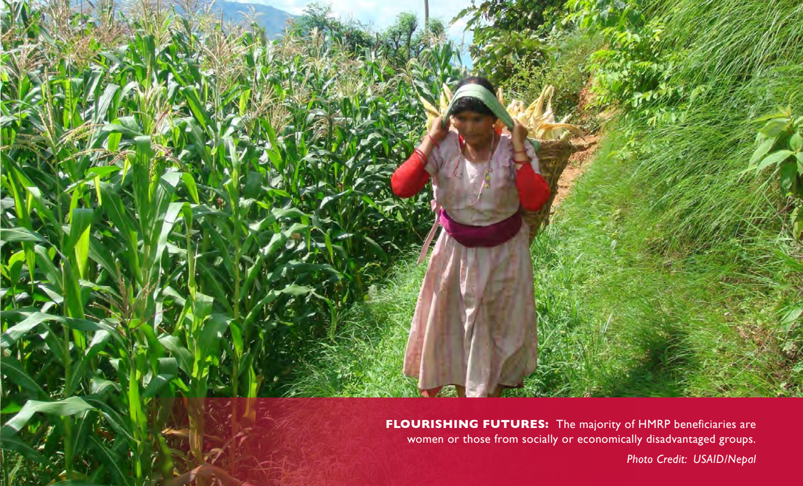
FLOURISHING FUTURES: The majority of HMRP beneficiaries are women or those from socially or economically disadvantaged groups.

T here is a common saying in Nepal, “If there is no maize, there is nothing to eat.” Yet this staple crop, which makes up about a quarter of the country’s food grain supply, is in jeopardy. Climate change and limited access to new information and technology in the hill region are key challenges. Many families are consequently trapped in a cycle of extreme poverty, chronic hunger, and undernutrition.