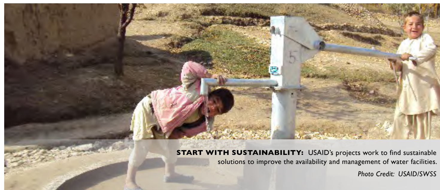
START WITH SUSTAINABILITY: USAID’s projects work to find sustainable solutions to improve the availability and management of water facilities.

It’s time to think of sustainable WASH services at scale. If we tailor our approach and work with our global and local partners to think long term and big picture, we can achieve real sustainability of WASH services and tangible and effective development outcomes.