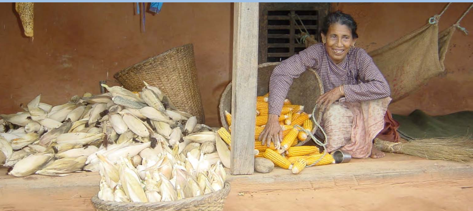
MAIZE FOR DAYS: Maize is the staple crop in Nepal, but it is in jeopardy. HMRP is working to make it more sustainable.