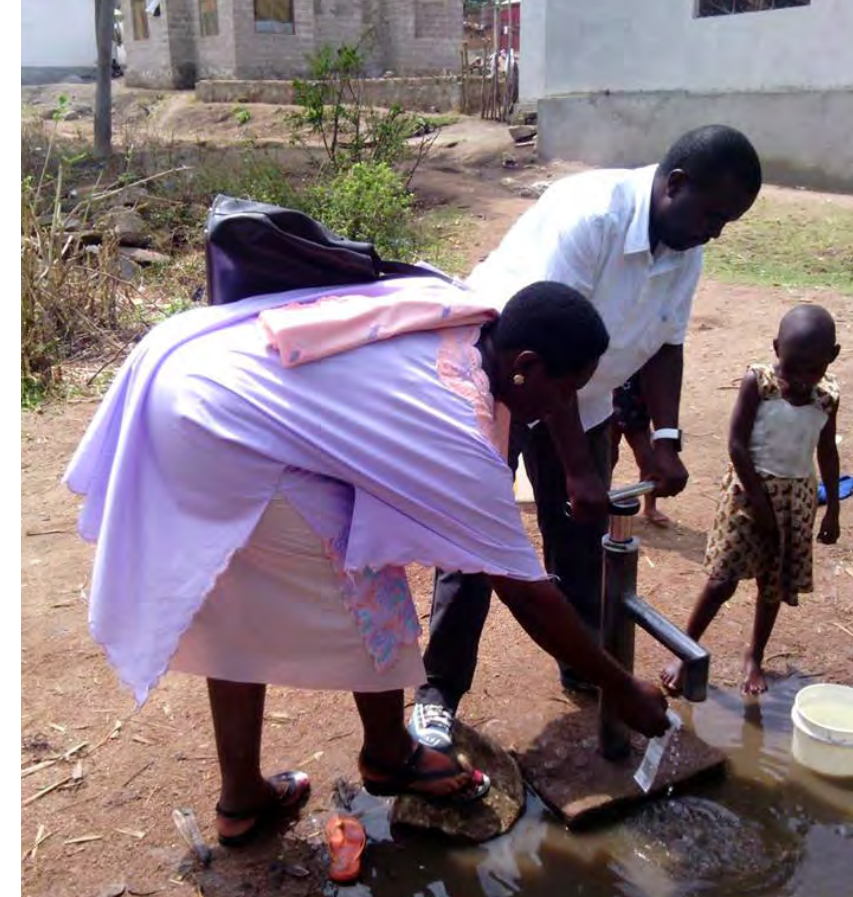
QUALITY CONTROL: mWater makes it easier to perform water quality testing in Tanzania.

We support a number of different methods, including a very simple presence/absence test for E. coli that costs less than $5 and does not require special equipment or experience to conduct. We also support more quantitative methods where you actually count the number of bacteria on a plate, and the app even helps with the counting using the onboard camera. Since bacteria such as E. coli are used as indicators of fecal contamination, it is less important to know exact counts unless you are conducting scientific research. For public water supplies that are functioning properly, E. coli should not be present at any level.