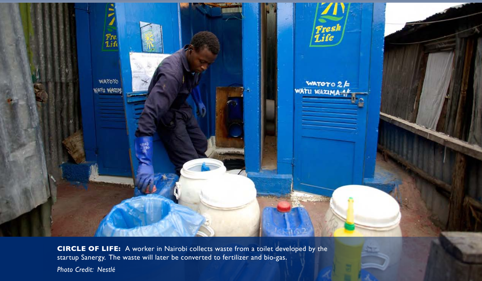
CIRCLE OF LIFE: A worker in Nairobi collects waste from a toilet developed by the startup Sanergy. The waste will later be converted to fertilizer and bio-gas.

San-i-ta-tion is the act or process of prevention of human contact with the harmful waste.