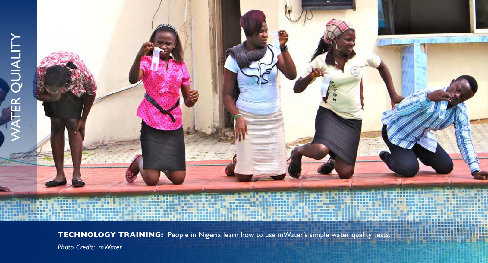
TECHNOLOGY TRAINING: People in Nigeria learn how to use mWater's simple water quality tests.