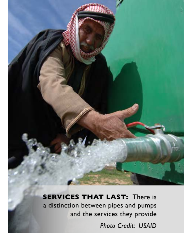
SERVICES THAT LAST: There is a distinction between pipes and pumps and the services they provide

The Strategy also calls for the Agency to make longer-term investments in monitoring and evaluation of water activities in order to assess sustainability beyond the typical USAID program cycle and to enable reasonable support to issues that arise subsequent to project implementation. This is an important way for us to know when we have been successful in our drive to foster environments for sustained service. Here again, we need to be mindful not just of our own monitoring and reporting needs, but of the need for governments and local stakeholders to have ownership of these monitoring systems. And we need to design our interventions to build local capacity to monitor, evaluate, research, and learn.