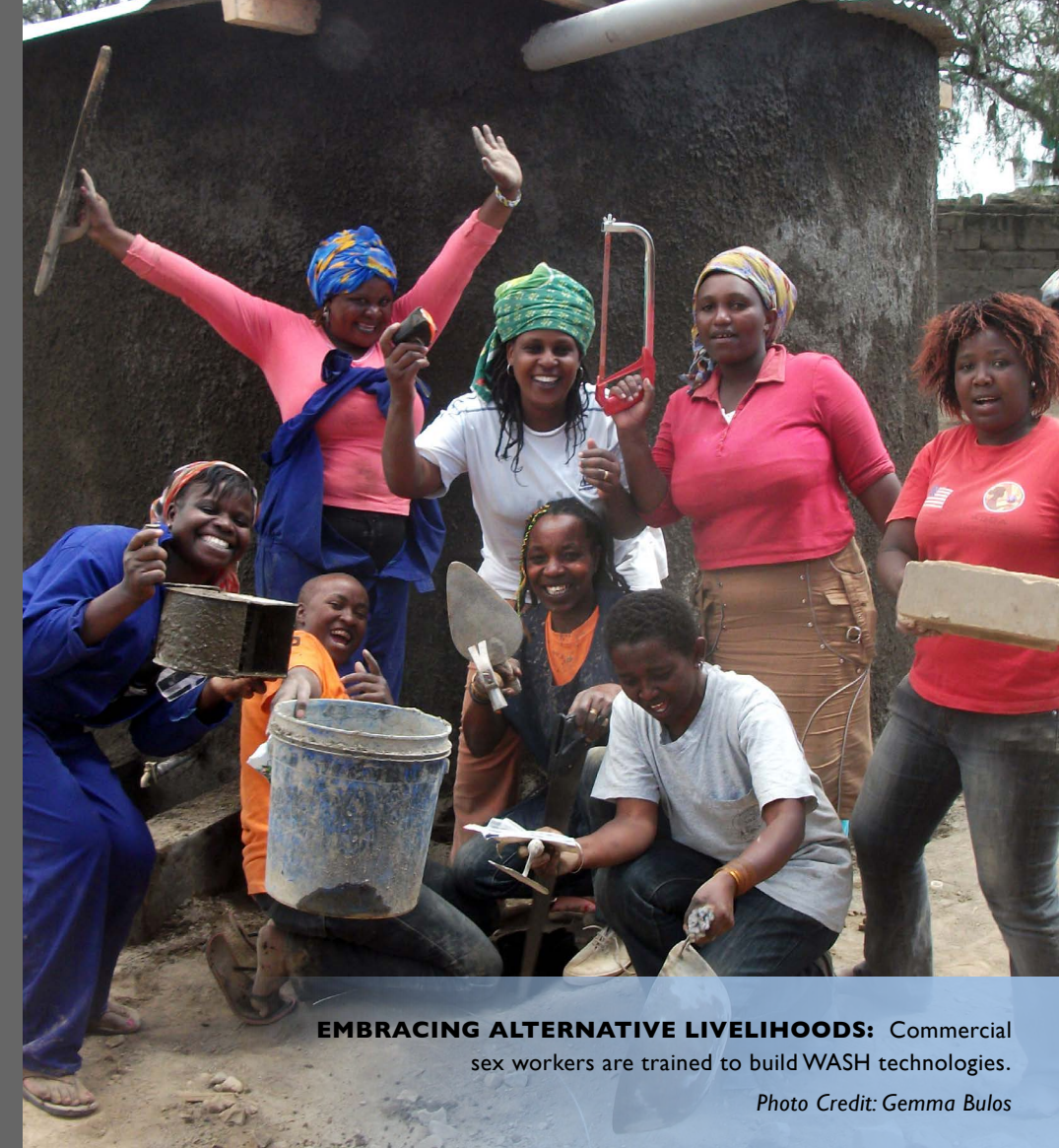
EMBRACING ALTERNATIVE LIVELIHOODS: Commercial sex workers are trained to build WASH technologies.

USAID took an important step to ensure that women’s voices are taken into account with the 2013 release of its Water and Development Strategy. The Strategy seeks to ensure that women are empowered to effectively advocate for their perspectives and priorities, and that they are able to fully engage as managers, partners, and entrepreneurs in water-related activities and enterprises. This is a promising start, but much work still needs to be done. It is now up to us, the development community, to