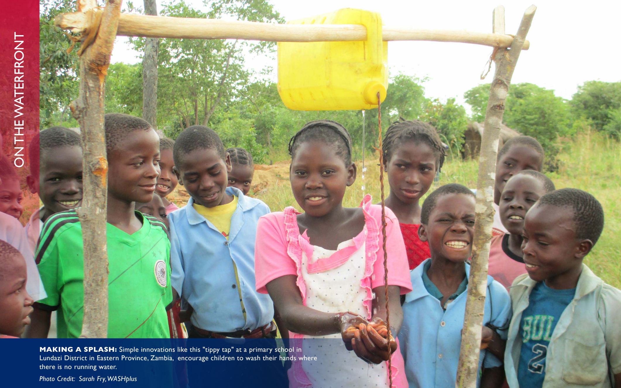
MAKING A SPLASH: Simple innovations like this "tippy tap" at a primary school in Lundazi District in Eastern Province, Zambia, encourage children to wash their hands where there is no running water.