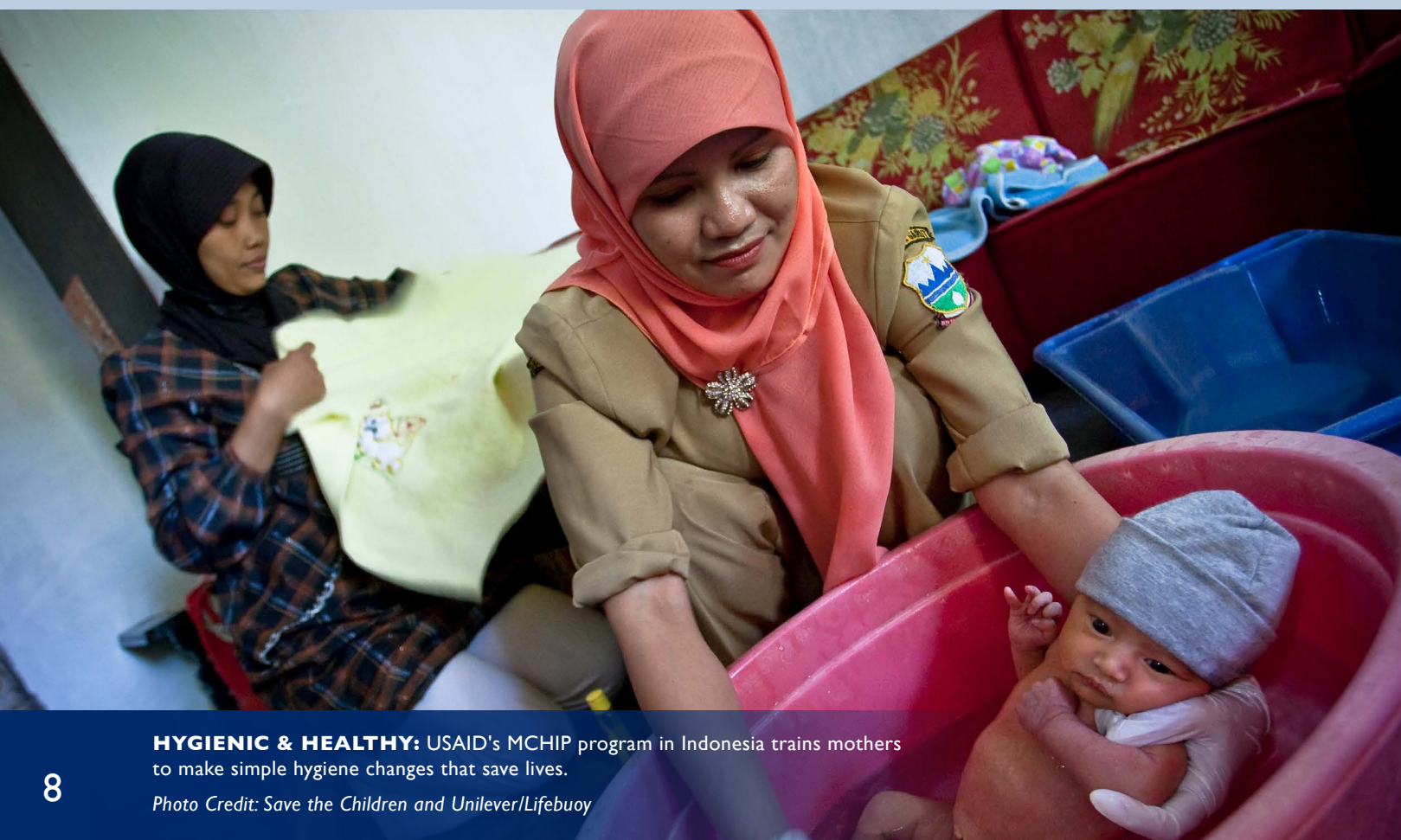
HYGIENIC & HEALTHY: USAID's MCHIP program in Indonesia trains mothers to make simple hygiene changes that save lives.