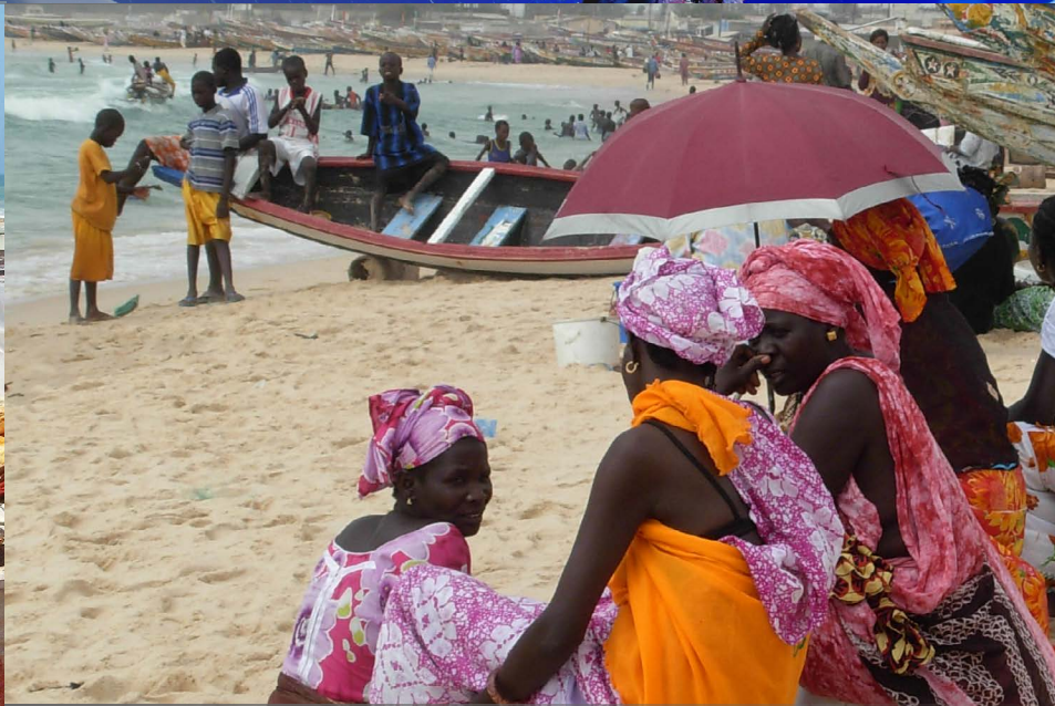
A VIBRANT COMMUNITY: Cayar women gather on the beach, waiting for the daily catch.

sustainable processing sites for them. But this involved attaining land and permits from local authorities, some of whom discriminated against women. Project staff spent a lot of time lobbying stakeholders and explaining the ways women processors could benefit the environment, the economy, and the community. It was an arduous process but it paid off when they obtained land for a new processing unit for women in Cayar.