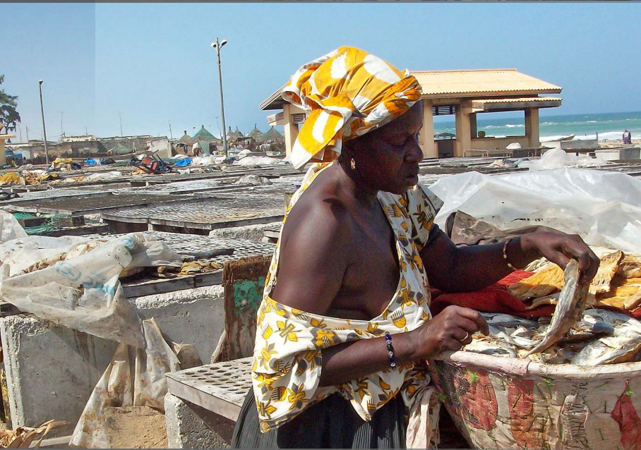
FROM FISH TO FOOD: A Cayar fish processor salts the catch.