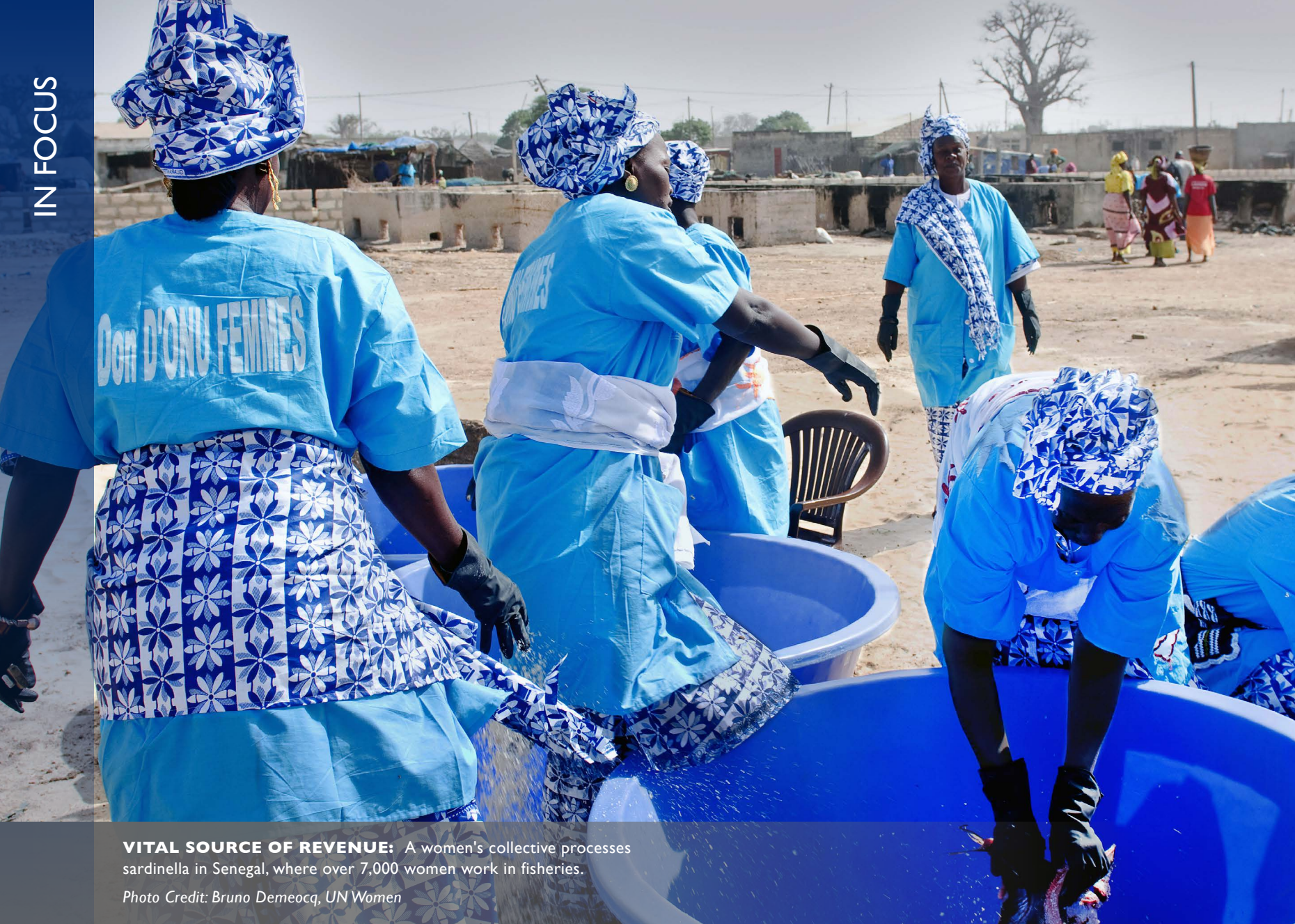
VITAL SOURCE OF REVENUE: A women's collective processes sardinella in Senegal, where over 7,000 women work in fisheries.