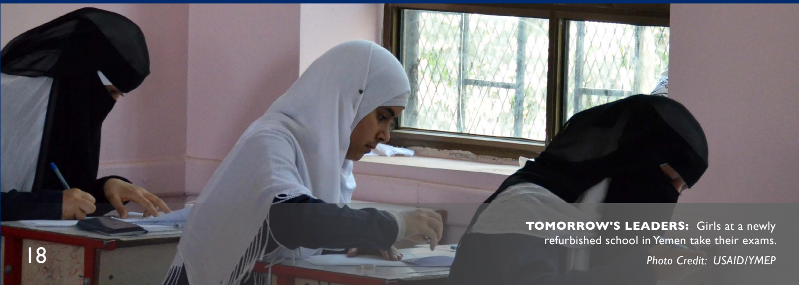
TOMORROW'S LEADERS: Girls at a newly refurbished school in Yemen take their exams.

U.S. National Action Plan on Women, Peace, and Security