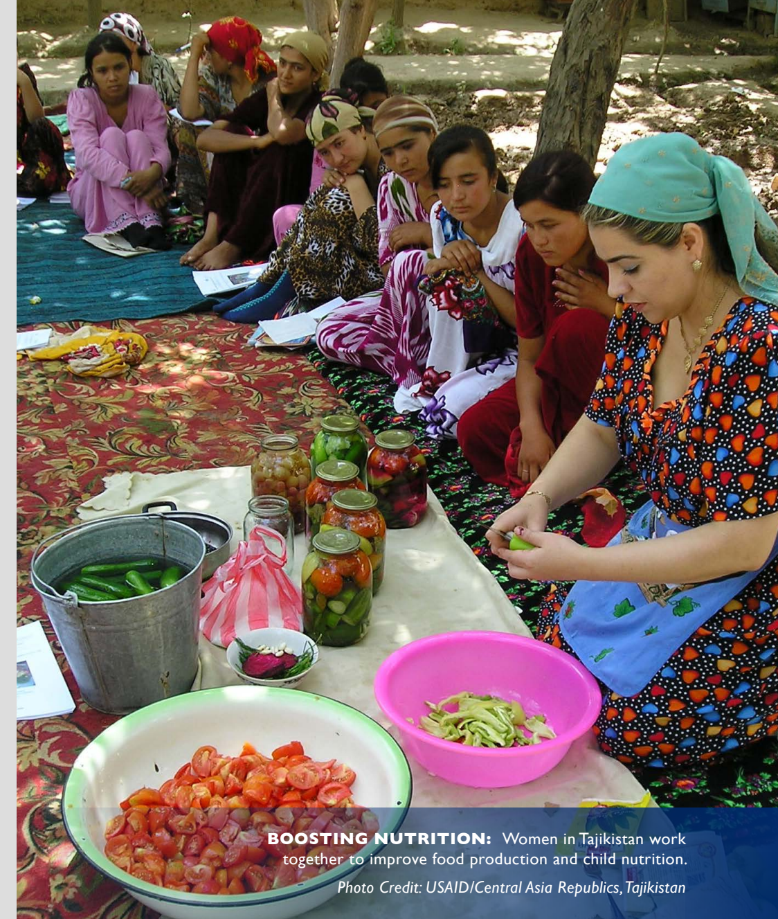
BOOSTING NUTRITION: Women in Tajikistan work together to improve food production and child nutrition.