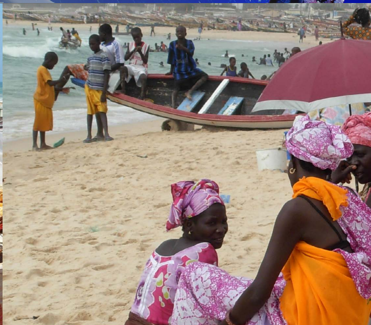
A VIBRANT COMMUNITY: Cayar women gather on the beach, waiting for the daily catch.