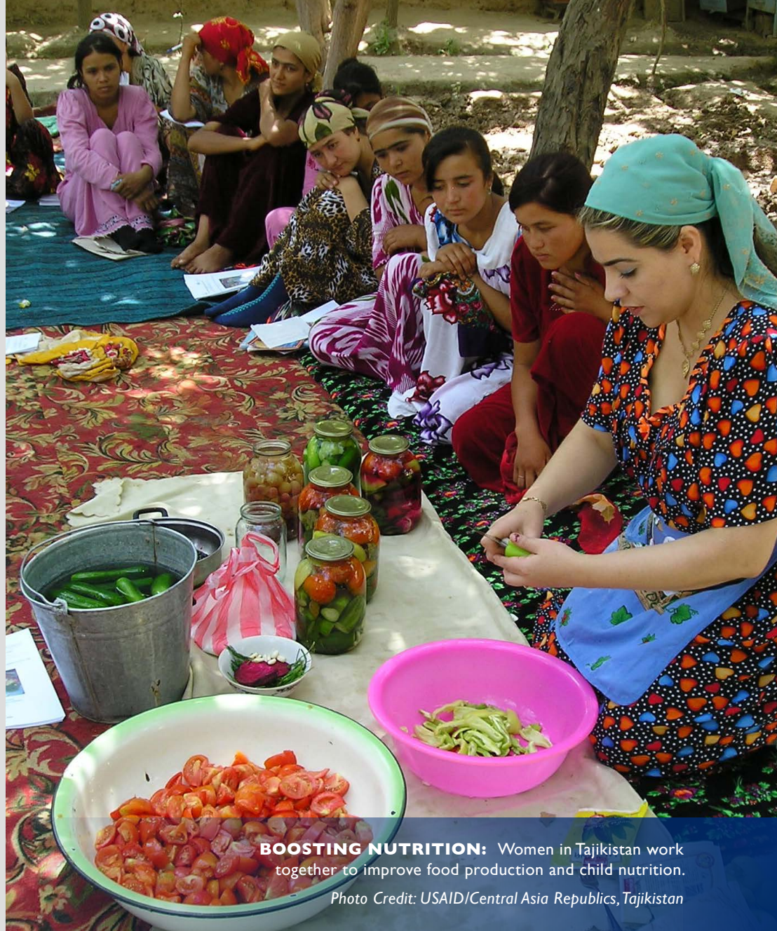
BOOSTING NUTRITION: Women in Tajikistan work together to improve food production and child nutrition.