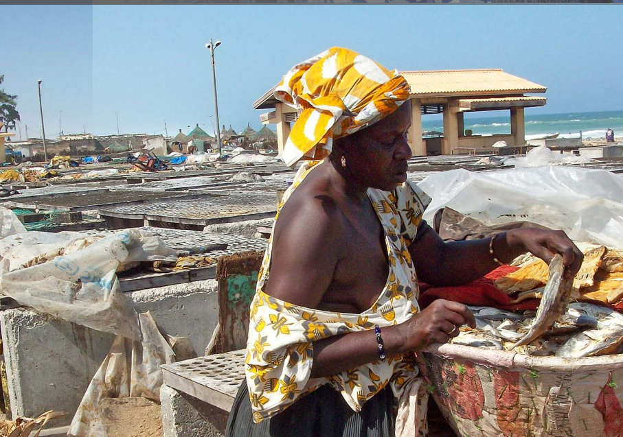
FROM FISH TO FOOD: A Cayar fish processor salts the catch.