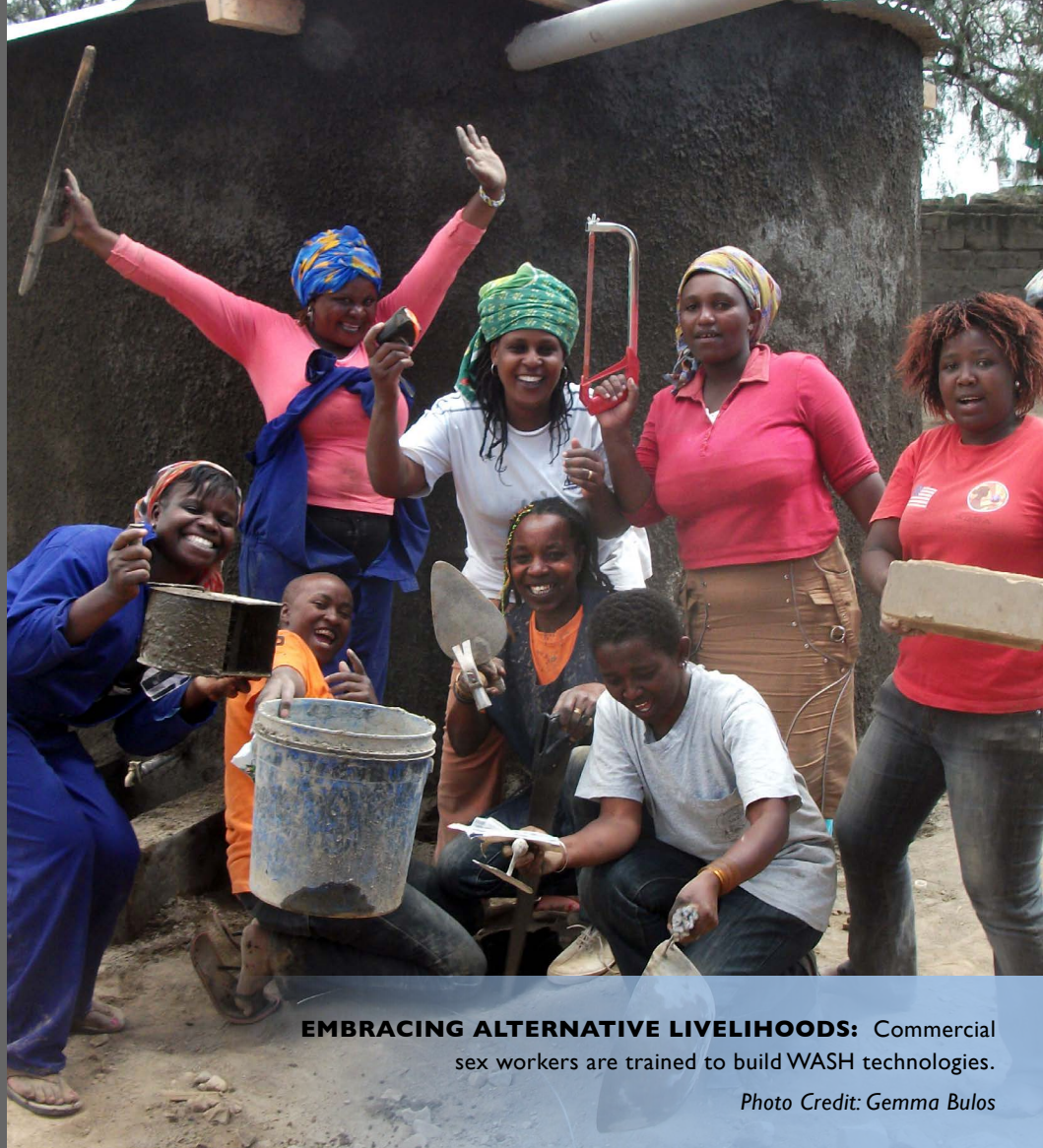
EMBRACING ALTERNATIVE LIVELIHOODS: Commercial sex workers are trained to build WASH technologies.

USAID took an important step to ensure that women's voices are taken into account with the 2013 release of its Water and Development Strategy. The Strategy seeks to ensure that women are empowered to effectively advocate for their perspectives and priorities, and that they are able to fully engage as managers, partners, and entrepreneurs in water-related activities and enterprises. This is a promising start, but much work still needs to be done. It is now up to us, the development community, to