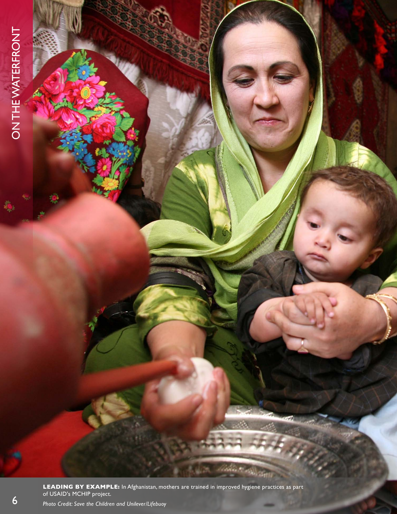
LEADING BY EXAMPLE: In Afghanistan, mothers are trained in improved hygiene practices as part of USAID's MCHIP project.