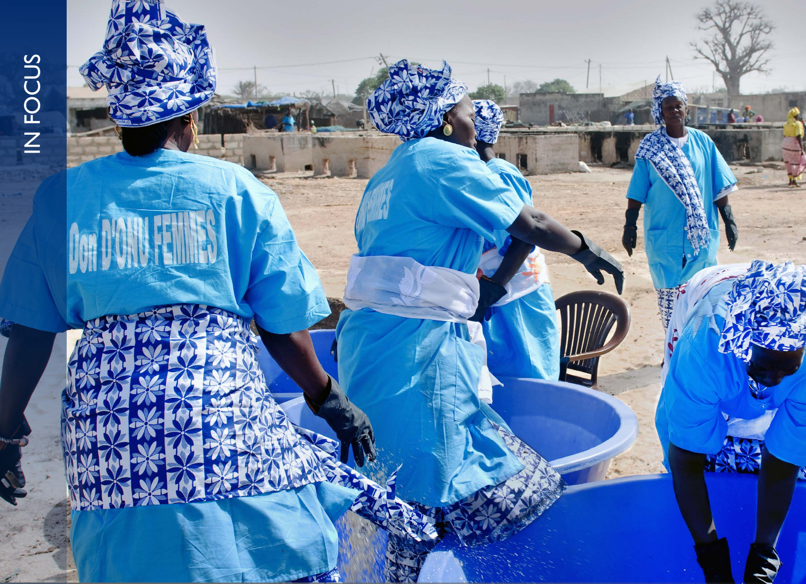
VITAL SOURCE OF REVENUE: A women's collective processes sardinella in Senegal, where over 7,000 women work in fisheries.