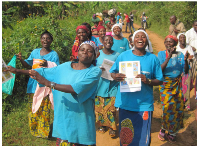
Care Group Volunteers in Bukinyanya Commune sing a song about malaria prevention and early care-seeking.