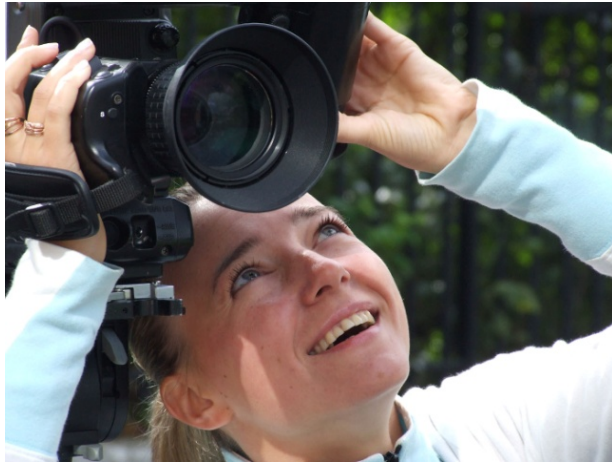
Learning how to operate a camera.

In order to create the necessary demand for inclusive and accountable governance, the Mission's program will increase its focus on building citizen and civil society capacity to meaningfully influence the development and monitoring of government policies at the national level. In order for this goal to be achieved, citizens and civil society alike need both access to quality information and sufficient technical