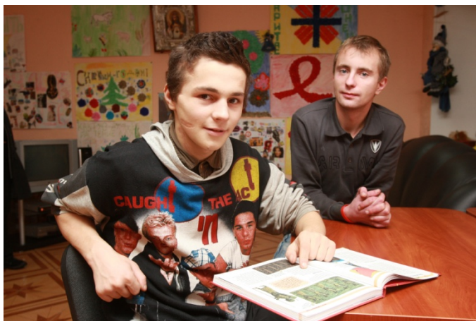
USAID supports care centers for street children.

Efforts are focused primarily in the sector of infectious diseases (HIV/AIDS and TB), with important but modestly-funded program in FP/RH. In addition, when resources permit, the Mission provides moderate assistance in health reform and health systems strengthening. While USAID recognizes the need for improved health financing in order to achieve sustainable health systems, interventions that address health financing will be conducted as a component of other health interventions defined below. The geopolitical and strategic importance of