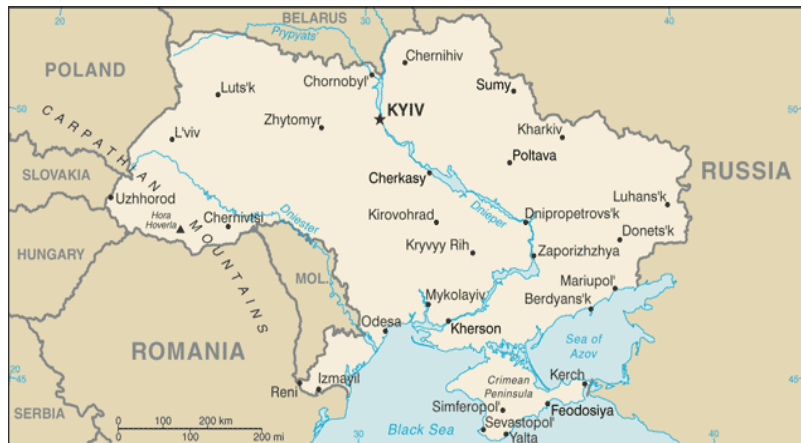
CIA, "Map of Ukraine," The World Factbook , 31 Dec. 2012 < https://www.cia.gov/library/publications/the-world-factbook/maps/maptemplate_up.html >.

Ukraine is composed of 24 oblasts (provinces), one autonomous republic (Crimea), and two cities with special status: Kyiv, its capital and largest city, and Sevastopol, which houses Russia's Black Sea Fleet. Ukraine is a republic under a presidential/parliamentary system (which has been a source of many Constitutional challenges), with legislative, executive, and judicial branches.