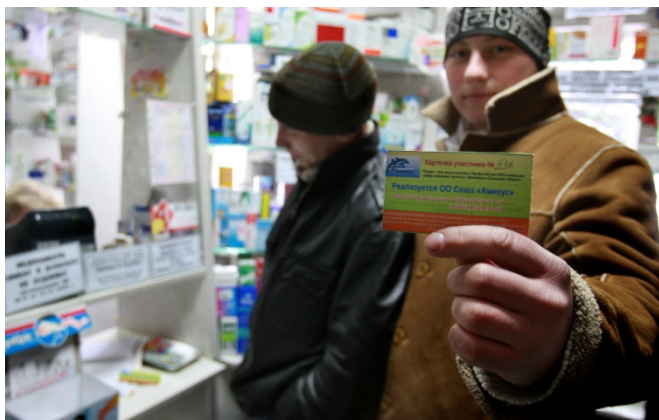
USAID supports free HIV protection services in pharmacies.

The Mission supports the GOU's work on critical aspects of health reform, which address the issue of consolidation of health facilities and increased coordination for efficiency and greater quality of care. Monitoring and evaluation (M&E) is a particularly important area for technical assistance to the GOU. The Mission is strengthening the national surveillance systems for TB and HIV/AIDS as well as introducing tools for better analysis and use of data. USAID, as part of PEPFAR, is supporting sustainability planning in such areas as management and planning for civil society groups working on HIV. This project supports national policy development and capacity building of GOU officials. It also finances leading partners, such as the Ukrainian Red Cross, which has a nationwide volunteer network of 600,000 people, and a recognized track record of work in the health sector, as well as significant local private sector funding. The Mission is also investing in technical assistance to improve logistics for the