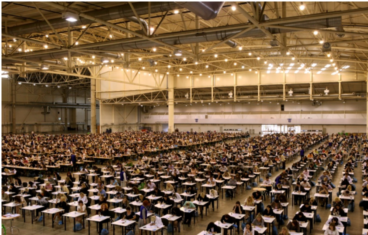
USAID supports national testing for judicial candidates.

To address the issue of on-going corruption in Ukraine and enhance the transparency of the GOU, USAID will insure that many of its programs incorporate the goal of combating corruption. In past programming, the most successful interventions have been those that provided specific, targeted tools to combat specific problems. Thus, in order to enhance the transparency of the judicial selection process and the professionalism of the judicial corps, the Rule of Law project will continue to help the High Qualifications Commission of Judges (HQC) develop and implement the methodology and validation process for anonymous judicial testing. Another USG-supported standardized test procedure,