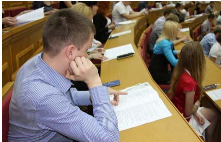
A judicial candidate takes an anonymous test at Kyiv National University on May 22, 2011.

The administration has taken few steps to address the issue of public sector corruption. Corruption is a pervasive problem affecting all sectors — including business, education, healthcare, and agriculture — and all citizens, making it particularly difficult to root out. USAID will integrate opportunities to reduce corruption across all technical areas, supporting the standardization of government processes and increasing the transparency of decision making processes.