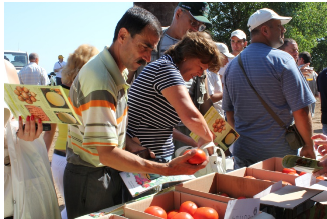
Farmers examine new tomato varieties as investment opportunities for better yielding crops.

Given resource restraints, USAID efforts in some areas, such as capital market development, fiscal reform, and national budget planning and management, will focus solely on supporting local oversight efforts to assure government accountability. This is a low cost means to help preserve gains made through previous USG technical assistance aimed at building more transparent institutions that operate according to international norms. Under the strategy period, USAID programs will devote more significant resources to