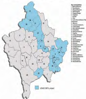
Mercy Corps SKYL Program ongoing projects in key municipalities - Updated November 2011

completed advanced leadership, conflict mitigation and negotiation trainings respectively, surpassing the programmatic goal of 80.