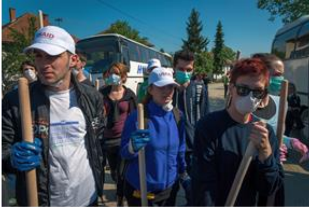
USAID volunteers in Maglaj to help families dig out of mud after floods of May 2014.

The U.S. Government provided more than $2.5 million in humanitarian assistance in the immediate aftermath of the disaster, including 26 rescue boats in the first 24 hours of the emergency declaration, which saved hundreds of lives. The difficult task of recovery has now begun.