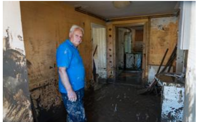
Maglaj man stands in his home after May 2014 floods in Bosnia and Herzegovina.

Over the next nine months, the FIRMA Project 2 will disburse $1.7 million in small grants to help flood-affected small businesses restart operations, retain employees, and maintain their place in the market. FIRMA also helps companies apply to banks, government, and international financial institutions