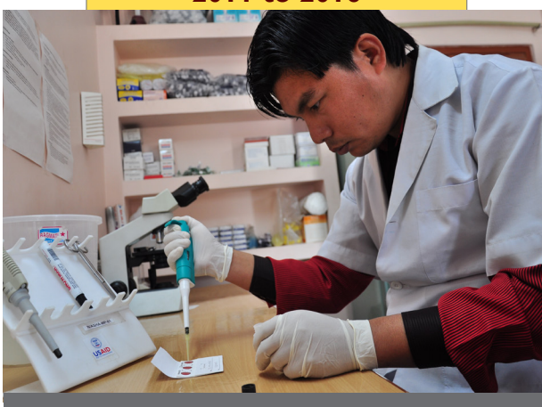
Successful integration of family planning into HIV program