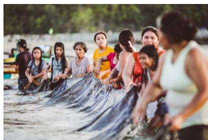
USAID supports sustainable management of coastal fisheries for over 1.5 million Filipinos.

One of the world’s most disaster-prone countries, the Philippines loses up to $5 billion every year due to natural disasters. The U.S. and the Philippines partner to enhance the country’s environmental resilience and mitigate the impacts of natural disasters. For long-term resilience, USAID works with the Philippine Government to improve natural resource management, reduce disaster risks and integrate low-emission development strategies in local planning.