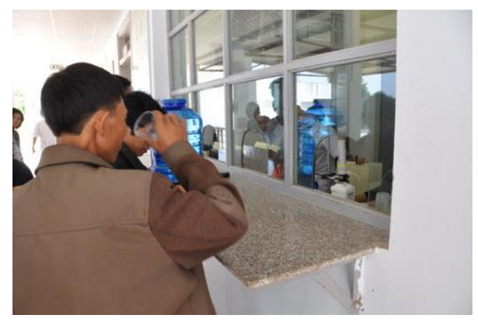
USAID supports methadone maintenance treatment in Dien Bien.

USAID's contribution to the interagency efforts to fight HIV/AIDS will be focused in three areas: