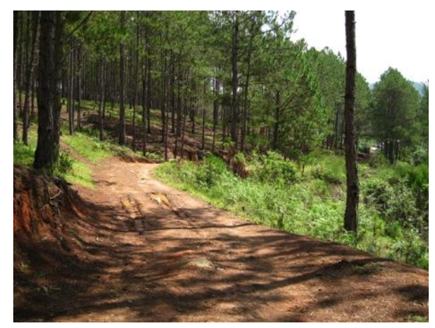
Tropical forests in Vietnam.

As of 2005, approximately 37 percent (12 million ha) of the country's total land area was classified as forested land, including roughly 10 million ha of natural forest and two million ha of plantation forest. Natural forest vegetation has declined dramatically in quantity and quality during the past 50 years. Government recognition of this trend led to new efforts at forest protection in the mid-1990s and has resulted in an increase in forest cover in recent years. However, a majority of recently reforested area is in monoculture plantation forest; intact primary forest remains today only in small, isolated remnants in the high mountains. Vietnam has a system of protected