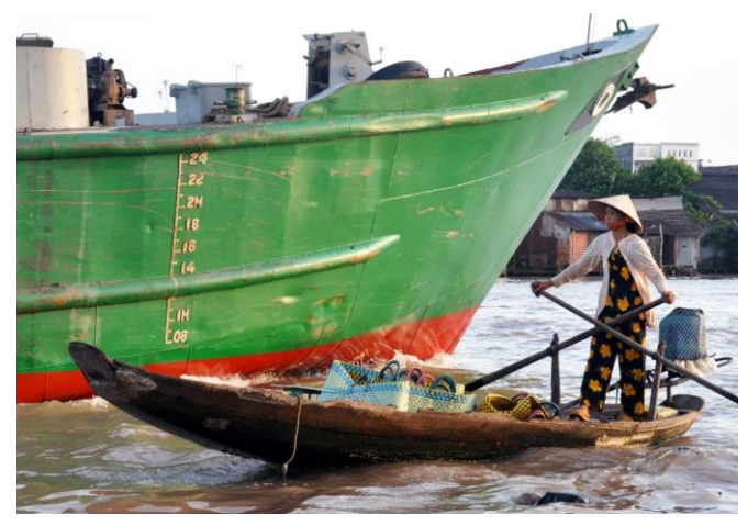
The country's large population centers and key agricultural sectors are especially exposed to rising sea levels and increased storm risks in low-lying deltas and on its long coastline.

Over the past decade, Vietnam has made significant yet uneven progress in the economic and social sectors. Achievements in health care and education include increased enrollment in primary education and increased accessibility of public health resources. However, adequate country capacity<sup>20</sup> (human, public sector, private sector, NGO) is one of the critical missing factors in current efforts to meet the Millennium Development Goals (MDGs).<sup>21</sup> Development efforts in many countries will fail, even if they are supported with substantial funding, if the development of sustainable capacity is not given greater and more careful attention. This principle is generally well known and recognized by donor organizations and partner countries alike, and is articulated in the 2005 "Paris Declaration on Aid Effectiveness."