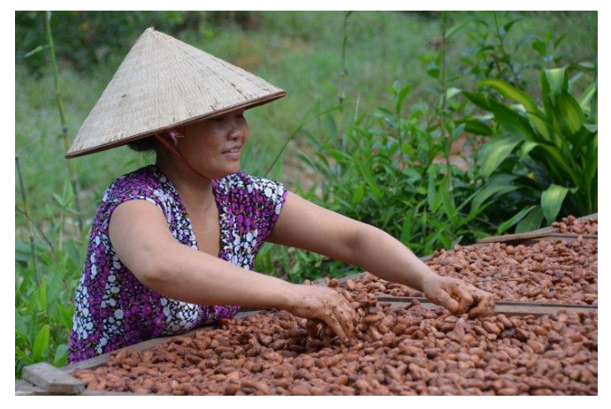
Farmers and their families in rural, central Vietnam profit from cocoa farming with USAID-sponsored training and support.

incomes. As a group, they have lower labor participation rates and higher unemployment rates in both rural and urban areas than people without disabilities. The National Coordinating Council on Disability has limited authority to influence other ministries beyond MOLISA thus limiting government-wide coordination on what should be identified as a cross-cutting matter. Additionally, disability policies meant to further integrate and advance the needs of persons with disabilities are neither adequately enforced once passed into law nor disseminated to local government offices and officials. Additionally, funding and government capacity remain an issue and disability programs that do exist in Vietnam, cover persons with mobility, vision, and hearing impairments, but are new to the issues of developmental disabilities.