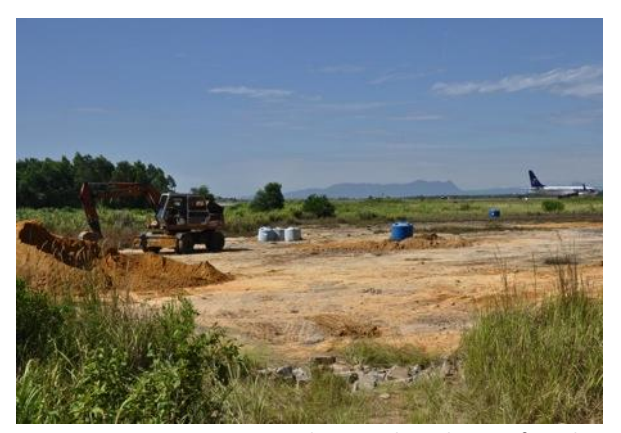
Areas at Danang International Airport have been referred to as a dioxin "hotspot" due to the high dioxin concentrations in soil and sediment.

One of the most significant remaining Vietnam War legacy issues is Agent Orange. Former U.S. airbases, including Danang, Bien Hoa, and Phu Cat have been referred to as dioxin "hot spots" due to high dioxin concentrations remaining decades after large volumes of Agent Orange and other defoliants were handled at these sites during the Vietnam War. High-level U.S. foreign policy objectives in Vietnam include resolving the Agent Orange issue, and in 2008, the USG and the GVN agreed, as their top priority on remediation efforts, to focus on Danang.