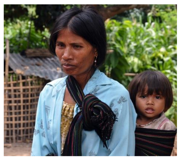
The poverty rate in Vietnam's rural areas is considerably higher than that of the urban areas.

Labor: The Vietnamese government will need to create a more enabling environment for operation of associations and enable collective bargaining to successfully close the TPP labor chapter. The congressionally-mandated Trafficking Victims Protection Reauthorization Act (TVPRA) list brought increased attention to the use of child labor and forced labor in Vietnam.<sup>3</sup> The U.S. Department of Labor and Department of State fund eight labor-related projects in Vietnam with the overarching goal of improving working conditions for Vietnamese.