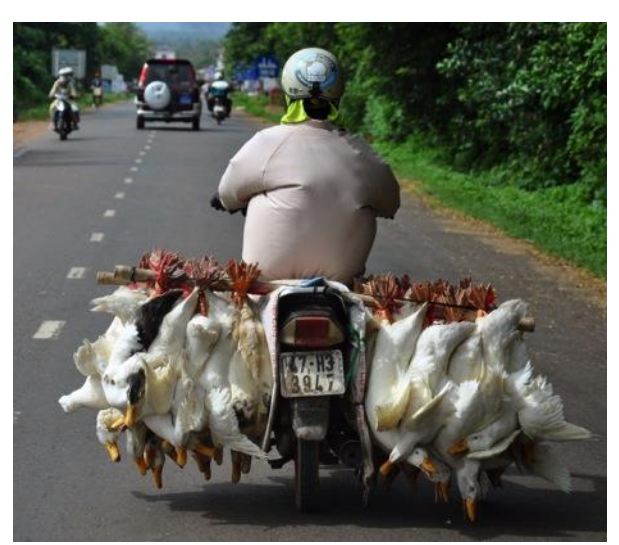
Vietnam is considered a "hot spot" for avian influenza and the emergence of other diseases.

Vietnam is one of four countries globally with endemic highly pathogenic avian influenza (HPAI) causing regular outbreaks in poultry (over 3,000 outbreaks and more than 40 million poultry culled to-date) and dangerous human cases (123 of which 61 have been fatal). The HPAI virus continues to evolve and pose a public health, animal health and economic threat.