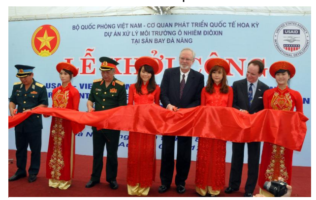
Ribbon Cutting at the Environmental Remediation of Dioxin Contamination at Danang Airport Project Launch.

Decades after U.S. engagement in armed conflict ended in Vietnam, hundreds of thousands of Vietnamese soldiers remain unfound or unidentified. The GVN estimates 650,000 soldiers are still missing in action. The U.S. Government has committed resources to helping the GVN locate or identify these lost persons.