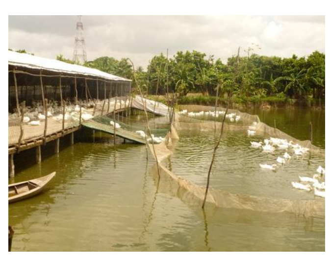
A duck farm in the Mekong Delta province of Can Tho.

Climate change is only one of several key areas to which Vietnam's population is vulnerable. The country is currently facing a double burden of disease, with increases in the share of morbidity and mortality from non-communicable diseases, accidents and injuries, along with the continued threat from communicable diseases, which require significant resources from the government. HIV/AIDS prevalence still remains a significant public health issue amongst targeted populations, as has dengue fever prevalence in the Mekong Delta, malaria in the Northern Mountains and Central Highlands, and tuberculosis in the South, including the emergence of multi-drug resistant tuberculosis (MDR-TB). Emerging pandemic threats, such as