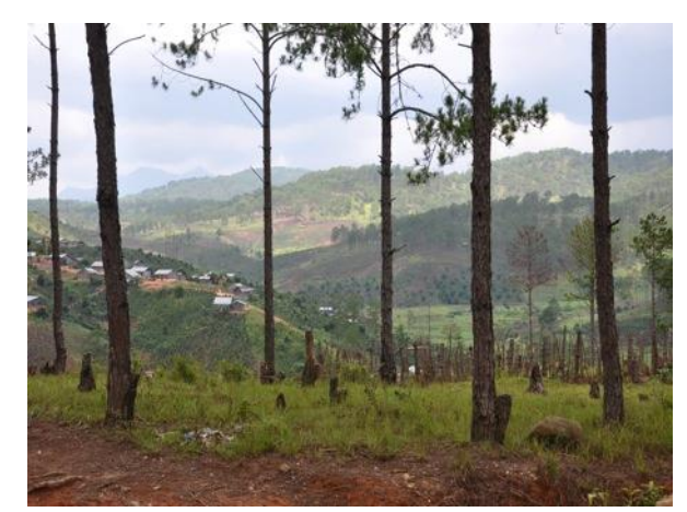
Forest degradation in Vietnam.

Due to extreme vulnerability to climate change impact, the GVN views climate change as one of its central development challenges and has identified climate change as a priority area for development assistance. GVN's climate change National Target Plan focuses largely on adaptation. It prioritizes water, agriculture, marine and coastal systems as most sensitive, and in particular prioritizes the need for adaptation action in the Mekong and Red River Deltas. The National Strategy for Climate Change