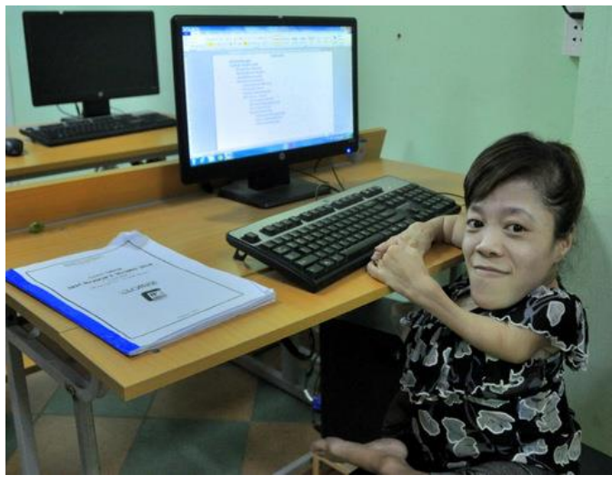
The USAID-supported training program for people with disabilities has trained approximately 1,000 young Vietnamese with disabilities on IT skills, soft skills, and job search skills; 85% of the students trained in advanced IT skills have found jobs.

Persons with disabilities account for as much as 15 percent of Vietnam's population.<sup>23</sup> A vast majority of persons with disabilities live in rural areas and attend school at rates far below those of non-disabled persons. Literacy rates are much lower for adult persons with disabilities than those without disabilities. In the world of work, few persons with disabilities have stable jobs and regular