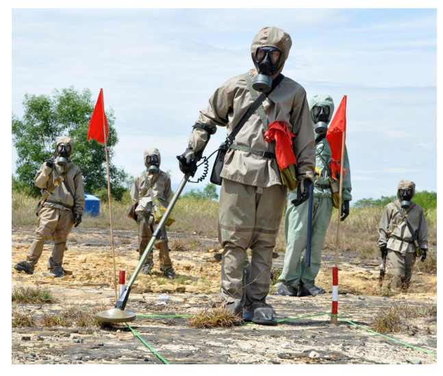
A Vietnamese soldier demonstrates UXO detection and clearance in Danang.

Vietnam has established a national-level strategic framework to address the complex and challenging problems associated with ERW with U.S. support. The U.S. continues to support direct service delivery for removal and disposal of UXO, risk education for vulnerable populations, and assistance to impacted persons in Vietnam's most heavily contaminated regions along the former demilitarized zone (DMZ). This direct support addresses immediate needs while modeling a proven comprehensive approach to dealing with ERW for the Vietnamese government. We also support enhancing the capacity of Vietnam's national authorities to