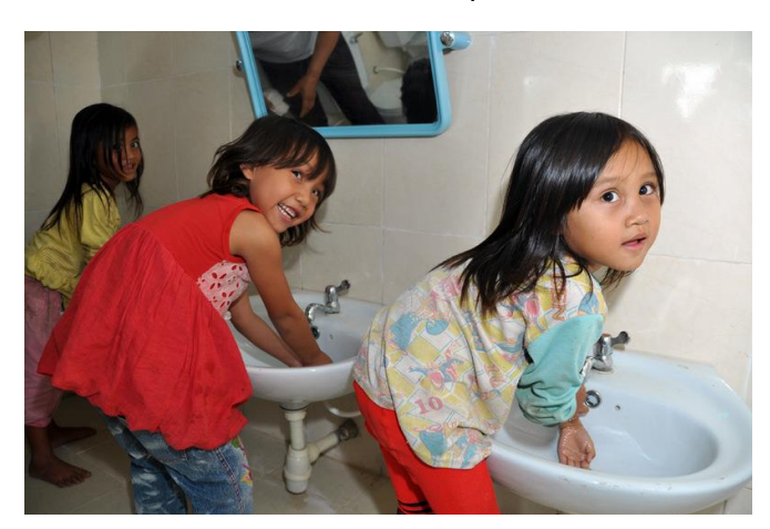
USAID supports early childhood development and kindergartens in the Central Highlands.

private sector to expand market based, economic opportunities for vulnerable populations, including ethnic minorities, the poor, particularly poor women and youth, as well as people living with disabilities or infected with HIV. This may include workforce skills development, access to finance, Micro-and-Small Enterprise technical assistance and other private sector value chain-based