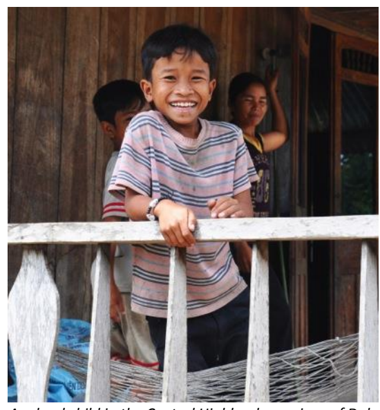
A school child in the Central Highlands province of Dak Lak.

economic participation. The ADB paper, a Framework of Inclusive Growth Indicators 2012, defines inclusive growth as economic growth with equality of opportunity and notes that policies for inclusive growth are supported by good governance and institutions (Note: See graphic below. Although the Mission does not anticipate integrating all aspects of the model into the CDCS, it provides a good basis for the linkages between inclusiveness, growth, and good governance). Importantly, this model links good governance and human capacity as essential elements of inclusive growth. The ADB has shown, for instance, that good governance (as measured via the CPI or other indicators) is correlated with inequality in incomes and educational attainment. Additionally, inclusive development partnerships are a key element of the Busan Partnership Document