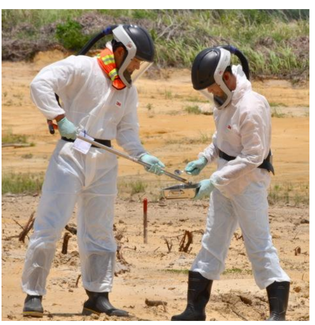
Soil sampling on the Environmental Remediation of Dioxin Contamination at Danang Airport Project site.

USAID will continue to work with its GVN counterparts to complete remediation of the Danang Airport site, as well as conduct a site-wide, comprehensive study of the Bien Hoa site. In harmonization with capacity- building activities, USAID's dioxin projects will alleviate tension around the Agent Orange issue while building relevant competency in Vietnam with regard to environmental assessments and remediation activities.