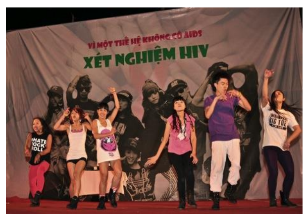
USAID and PEPFAR supports an outdoor concert to promote Vietnam's national action month for HIV/AIDS.

Vietnam has a concentrated epidemic among injecting drug users (IDUs), men who have sex with men (MSM), and sex workers (SW) and their clients. National HIV prevalence rates among the general population of 15-49 year olds is 0.43 percent. The 2009 HIV/STI Integrated Behavioral and Biological Survey (IBBS) Round II and sentinel HIV surveillance estimate that as many as 40 percent of the estimated 220,000 (range: 100,000-335,000) injecting drug users (IDUs) are infected with HIV. Injecting drug use is the leading driver in the transmission of HIV in Vietnam. There is also growing recognition of the HIV epidemic among MSM, with HIV prevalence among MSM in Hanoi and Ho Chi Minh City being estimated as high as 16 percent.