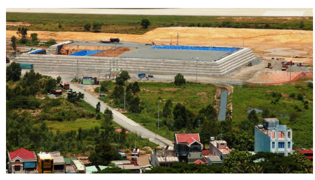
The pile structure for thermal desorption treatment of dioxin contamination at Danang Airport.

complex and challenging problems associated with ERW with USG support.