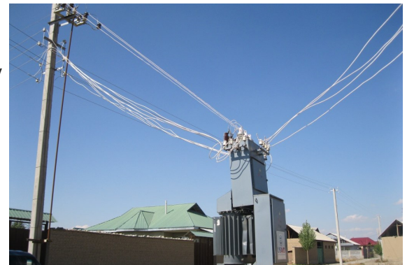
Several USAID programs support the Kyrgyz Republic's energy sector both in policy initiatives and infrastructure improvement.