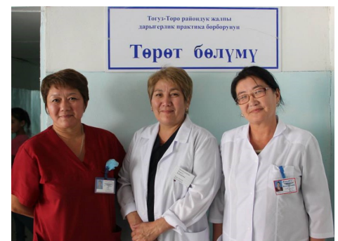
Doctors at Toguz-Toro regional maternity ward.

From June 20-22, USAID health officers, accompanied by Deputy Minister of Health Amangeldy Murzaliev , visited the remote Toguz Toro district of Jalalabad province to monitor the SPRING nutrition activity. Launched in March 2015, the USAID SPRING project is active in ten districts of Jalalabad addressing the extremely high rates of anemia among women and malnutrition among children of the Jalalabad region. USAID educates caregivers about child feeding, trains health workers on maternal and child nutrition, and supports community outreach on nutrition topics. Toguz Toro is both remote and mountainous and is only accessible during four summer months. In order for the joint USAID-Ministry of Health team to arrive, an avalanche was cleared from the main road. Deputy Minister Murzaliev expressed his gratitude that USAID was working in such a challenging location with a demonstrated need for nutrition assistance.