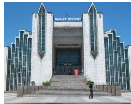
Bishkek Civil Status Registration Office opened in 1987 to be renovated with USAID's support.

This quarter, GGPAS supported the rehabilitation of two key Civil Status Registration (ZAGS) offices that serve nearly 1 million citizens in Bishkek and nearly 350,000 in Kara-suu district of Osh. These rehabilitated facilities will not only increase the functionality of and citizen satisfaction with services provided in these municipalities, but also are a critical pilot for the automated information system that the SRS plans to roll out to 60 ZAGS offices across the country. Simultaneously, GGPAS supported the long-term institutional development of the SRS by assisting with the agency's three-year institutional strategy, performance management system, and unified standard of services. All these long-term initiatives will help the SRS Central Office to more effectively manage the entire registration system, reducing corruption, improving service quality, and increasing citizens' satisfaction.