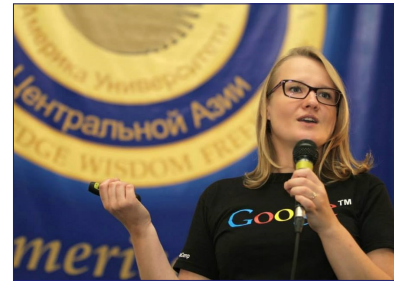
CAREER GUIDANCE FOR GRADUATING STUDENTS