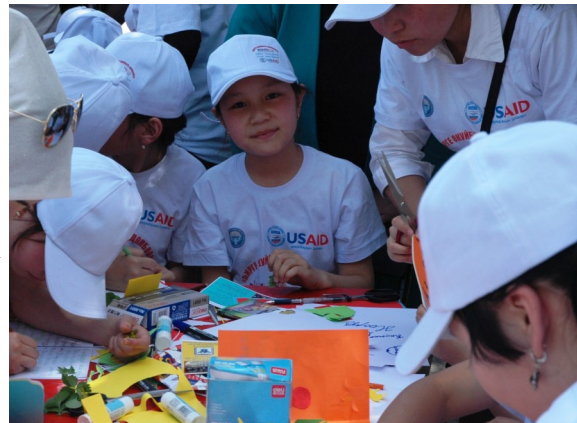
Primary grade students prepare for the hand-made books competition during the World Book Day.

Kyrgyzstan faces serious literacy challenges. Studies show that only 12% of primary grade students are able to read fluently and comprehend grade-level material. Public campaigns are one of the methods employed by USAID to promote the culture of reading.