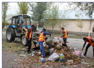
MUNICIPAL SERVICES TAKE A LEAP FORWARD