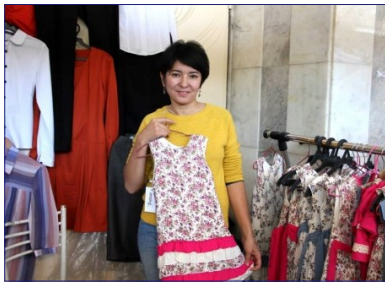
KYRGYZ WOMEN EXPAND SMALL BUSINESSES