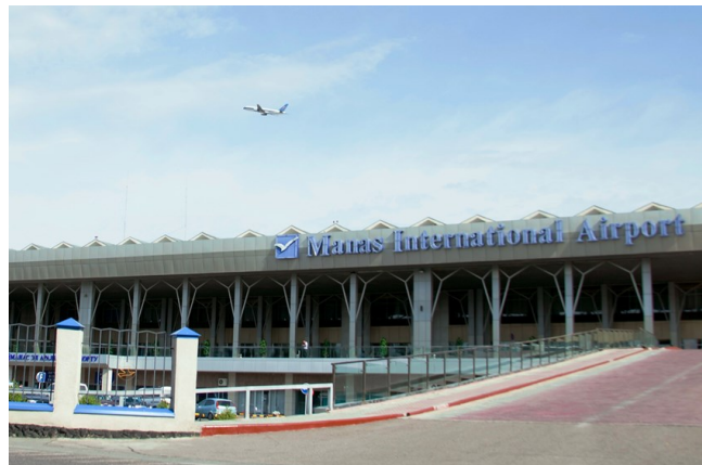
In the future, Manas International Airport in Bishkek may be able to resume flights from the EU if the country passes audit by the International Civil Aviation Organization .

The Kyrgyz Republic Parliament passed a new civil aviation law on June 29 that brings Kyrgyz aviation legislation in line with international standards. The President signed the Law in August. Passage of this legislation is an important milestone in the country's efforts to remove a ban on flights to and from the European Union. The ban was imposed by the EU in 2006 when the Kyrgyz Republic failed a European Commission air-safety audit managed by International Civil Aviation Organization (ICAO). The next challenge for the Kyrgyz Republic is to show tangible improvements to its air safety systems during an international air-safety audit planned for January 2016 . A strong showing on the forthcoming audit would bolster the Kyrgyz Republic's case for EU authorities to lift the flight ban. The drafting and passage of the new law were made possible by major technical assistance from USAID and fruitful cooperation between the Kyrgyz airline industry and the Civil Aviation Agency. USAID will continue to assist the Kyrgyz Republic in its efforts to turn legislative gains into tangible safety improvements and access to EU air-travel markets.