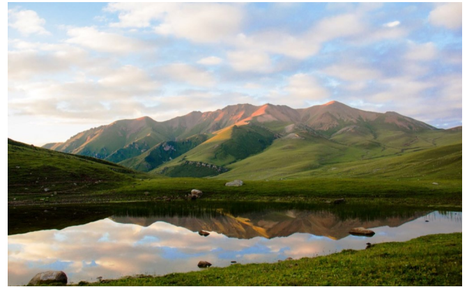
Ailanpa lake is one of the tourism destinations that will be supported by USAID.

BGI is also working in partnership with the Kyrgyz's National Statistics Committee (NSC) to improve the reliability of tourism statistics. BGI recruited a tourism statistics expert from the United Nations World Tourism Organization (UNWTO) to assess the NSC. One of the initial findings was that there is not a functioning inter-institutional platform for data collection and sharing - a common challenge for governments worldwide. USAID plans to work with the NSC and the Department of Tourism to improve their ability to collect, analyze and report accurate tourism data utilizing international standards, as well as increase the dissemination of tourism statistics through government websites.