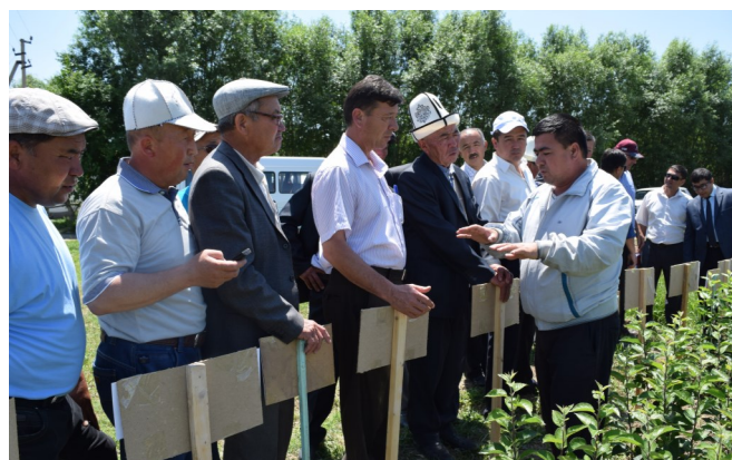
Regional farmers listening to a peer presentation on how to boost agricultural productivity.

On May 26 , the USAID Agro Horizon Project assisted the Ministry of Agriculture in hosting an agricultural field day in Osh Oblast. The event showcased twenty smallholder farmers' fields and greenhouses. Each of these farmers successfully adopted technologies that improved the production of early-season vegetables such as potatoes, cabbage, tomatoes, and cucumbers. Employing simple greenhouses, drip irrigation, and better seed varieties allowed these farmers to capture premium prices by bringing vegetables to market four to ten weeks earlier than usual. The event was led by Minister of Agriculture Taalaibek Aidaraliev and Osh Oblast Governor Sooronbai Jeenbekov . More than 150 farmers, agribusiness employees, and agricultural extension agents from every oblast in Kyrgyzstan participated.