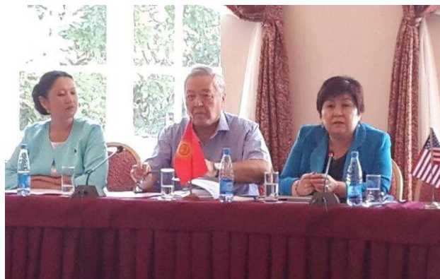
Participants of the parliamentary hearing discuss the trafficking report findings.