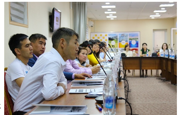
Training participants during the Q&A session.