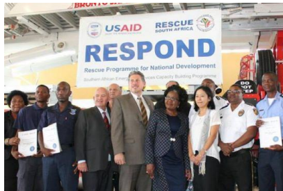
U.S. Embassy personnel and other honored guests attend the graduation of the Namibian RESPOND program, which trains workers in emergency response management.