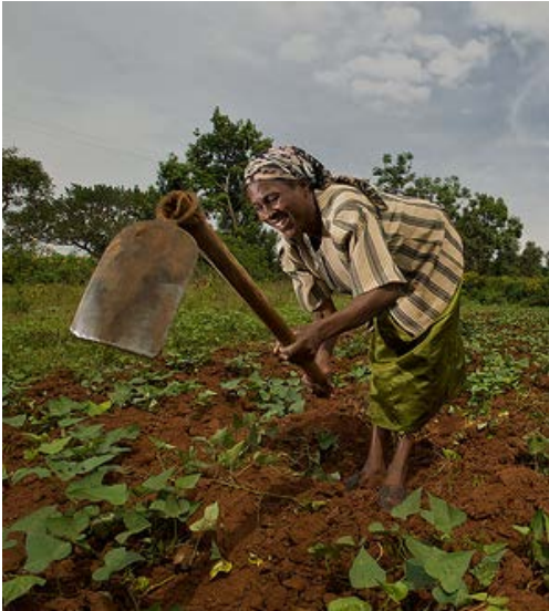
Tegemeo conducts household surveys to gather data on smallholder farmer behavior in Kenya.