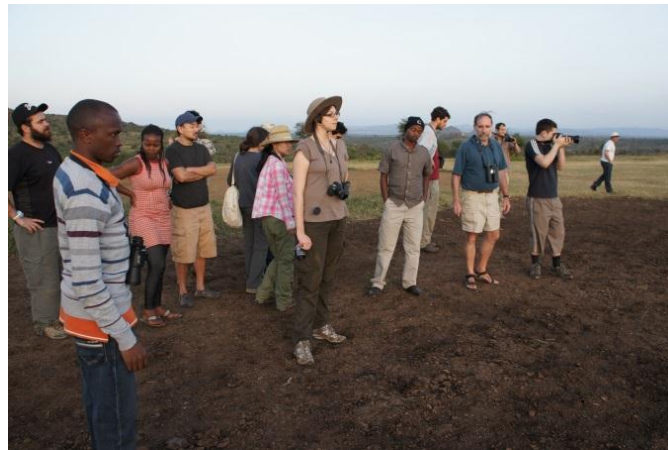
Students from University of Nairobi, Princeton University, and University of Illinois studying dryland ecosystems at Mpala Research Center.