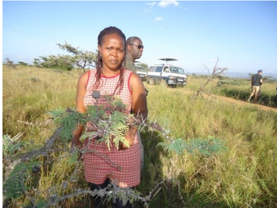
A University of Nairobi student on a field trip to the Mpala Research Center.

Presidential Initiative: Feed the Future