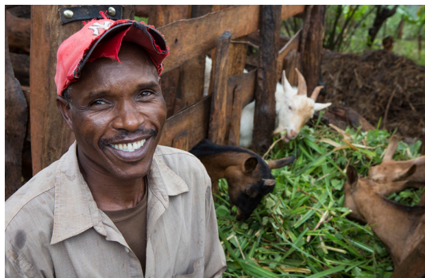
A CRS farmer with his family’s goats outside his home in Nyeri, Kenya.

As a new implementer of the 28 year old Farmer to Farmer Program (F2F), CRS will send US volunteers to almost 500 project assignments over the 5-year life of the project, to increase the productivity and marketing of key priority value chains, including livestock and grains, in line with USAID’s Feed the Future initiative. The program will benefit at least 350 host organizations, and train over 19,000 people, more than half of whom will be women. CRS has been in east Africa since 1965 and sees women as a growth engine for agriculture in the region.