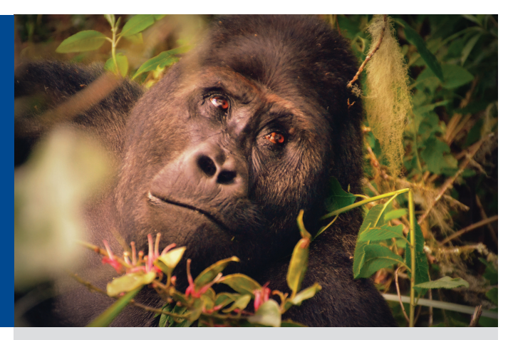
DEMOCRATIC REPUBLIC OF THE CONGO – 2015: USAID support for rangers in Kahuzi-Biega National Park helps protect populations of critically endangered Grauer's gorillas.