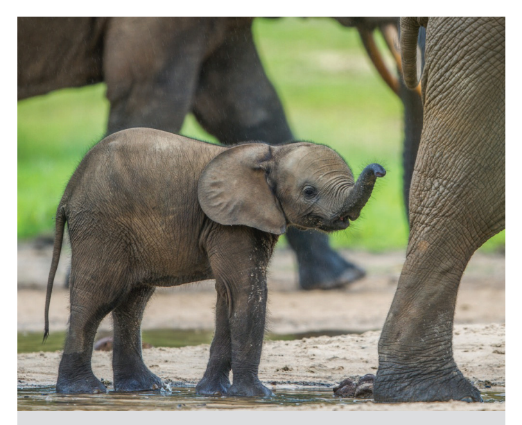
REPUBLIC OF CONGO – 2004: Forest elephant populations in the Sangha Tri-National Landscape are growing with the help of USAID's conservation efforts.