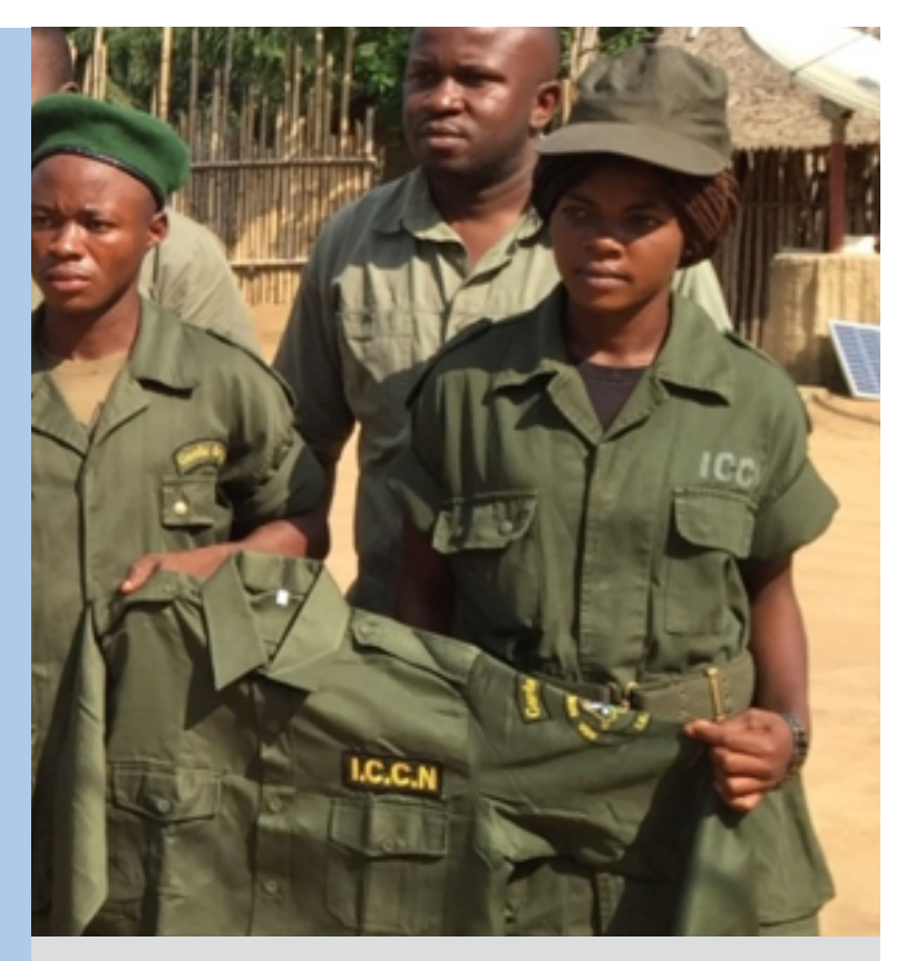
DEMOCRATIC REPUBLIC OF THE CONGO -2014: Eco-guards receive equipment in Maringa-Lopori-Wamba Landscape.