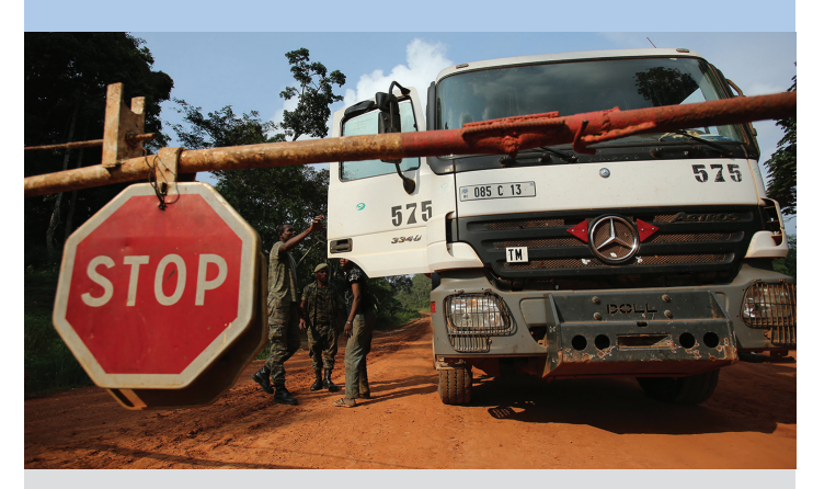
DEMOCRATIC REPUBLIC OF THE CONGO – 2012: Eco-guards check a logging truck in the Nouabalé-Ndoki National Park buffer zone.