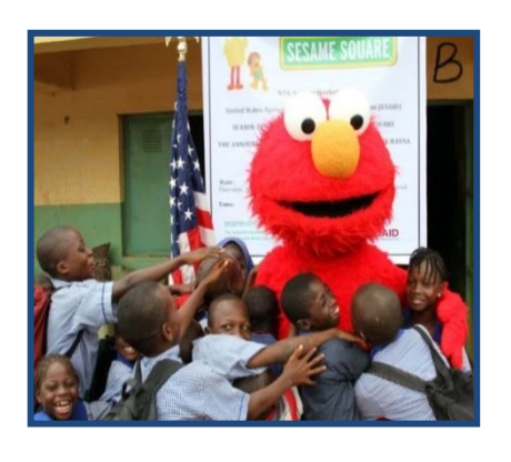
Elmo and Pupils at the Launch of Sesame Square Season 3