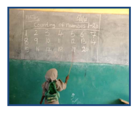
USAID supports girls' education

USAID employs a system-strengthening approach that supports the delivery of basic education services by addressing key issues in the management, sustainability and oversight of basic education. This includes support to the GON for data collection and analysis for appropriate educational policy and decision making. A major achievement has been the adoption of a system that tracks and prioritizes funding for education that has led to an increase in the education budget for the two states. Initiatives also strengthen nonformal education systems to provide orphans and vulnerable children with reading, mathematics, life skills, and psycho-social counseling.