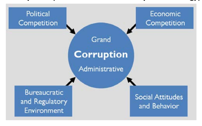
Figure 4. Corruption Dynamics and Access Points for Response (from USAID Anticorruption Strategy)

The sector-based Corruption Diagnostic Guide of USAID's Anticorruption Assessment Handbook can be an instrumental tool for pinpointing corruption vulnerabilities and the need for specific interventions for sectoral program. The Guide currently consists of detailed diagnostic questions for 19 sectors that allow policies, procedures and practices in a particular sector or function of government to be assessed. Questions are also included to examine corruption vulnerabilities and assess the capacity and readiness of civil society organizations, the business community, and the media to contribute to anticorruption efforts. The Diagnostic Guide can be expanded or modified and similar sets of diagnostic questions can be developed for other sectors and function as needed. Often, anticorruption programming in a particular